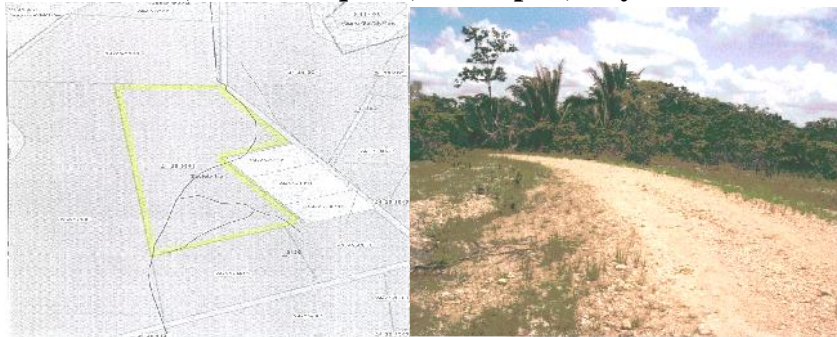
REGISTRATION SECTION Society Hall