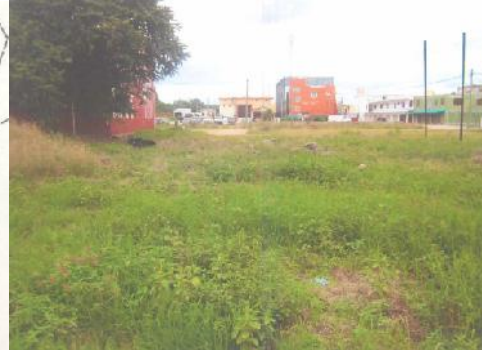
REGISTRATION SECTION Santa Elena