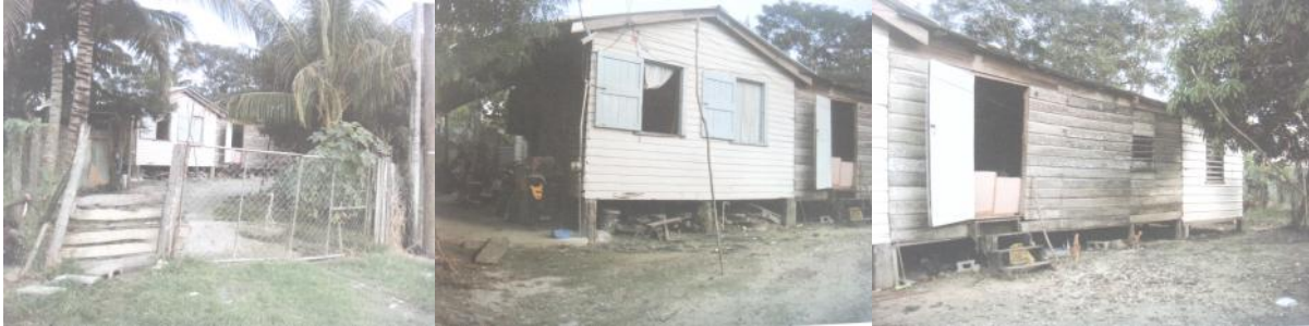
REGISTRATION SECTION Orange Walk Town

4. Parcel No. 2759 Unity Street, Orange Walk Town, Orange Walk District: