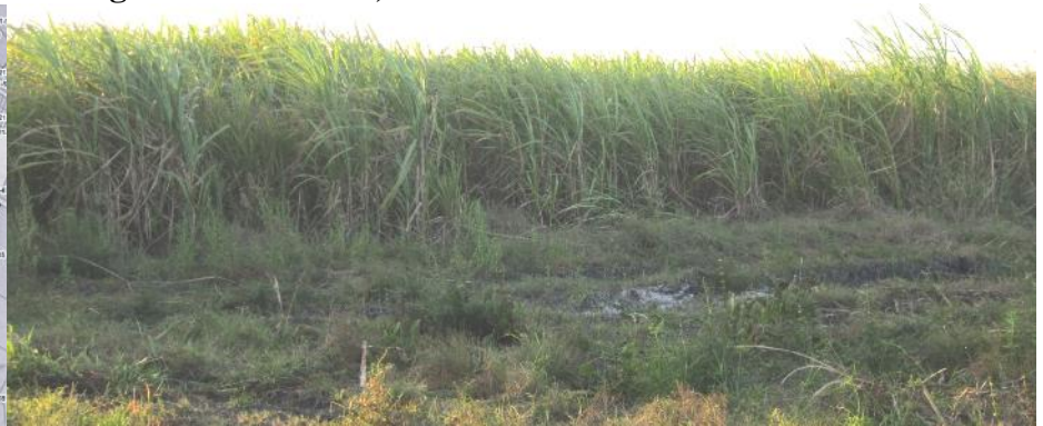
REGISTRATION SECTION BLOCK PARCELS Libertad 1 21, 42 & 280

(Being SUGAR CANE LANDS : Parcel 21 - 37.29 acres [33 ACRES cultivated with sugar cane] situate 1.7 kilometers west of Libertad-Buena Vista Road, Corozal District; Parcel 42 - 20.79 acres [14 ACRES cultivated with sugar cane] situate 1.5 kilometers southwest of Libertad Village, Corozal District; Parcel 232 - 42 acres [16 ACRES cultivated with sugar cane] situate 1.8 kilometers south of Libertad Village on the main Buena Vista-Libertad Road with electricity accessibility, Corozal District ; Parcel 280 - 19.99 acres [19.99 ACRES cultivated with sugar cane] situate 240 meters west of the Libertad-Buena Vista Road and approximately 7 kilometers south of Libertad Village, Corozal District, the freehold properties of Mr. Leonard Folgarait)