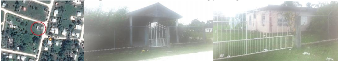
REGISTRATION SECTION Trial Farm

5. Parcel No. 246 corner Seagull & Sparrow Streets, Trial Farm Village, Orange Walk District: