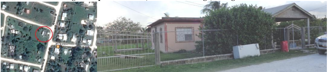
REGISTRATION SECTION Trial Farm