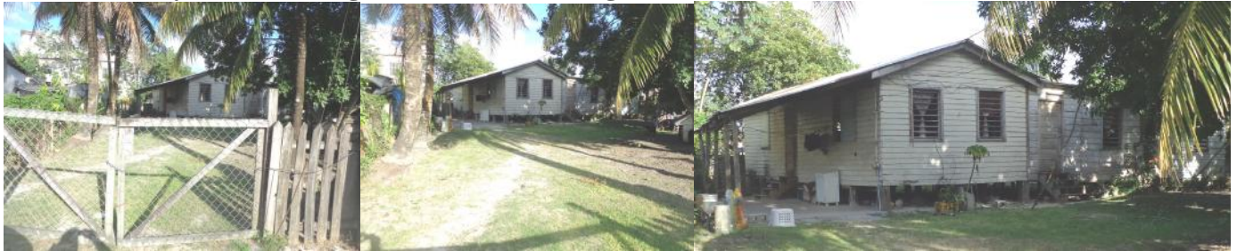
REGISTRATION SECTION Orange Walk Town