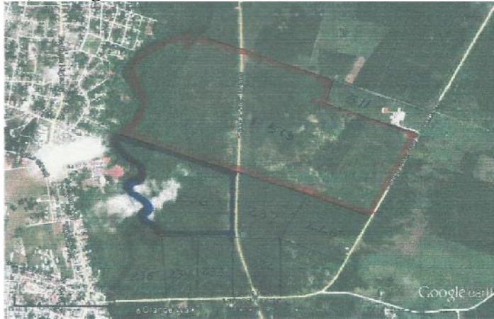
REGISTRATION SECTION BLOCK PARCEL Indian Hill East 4 236