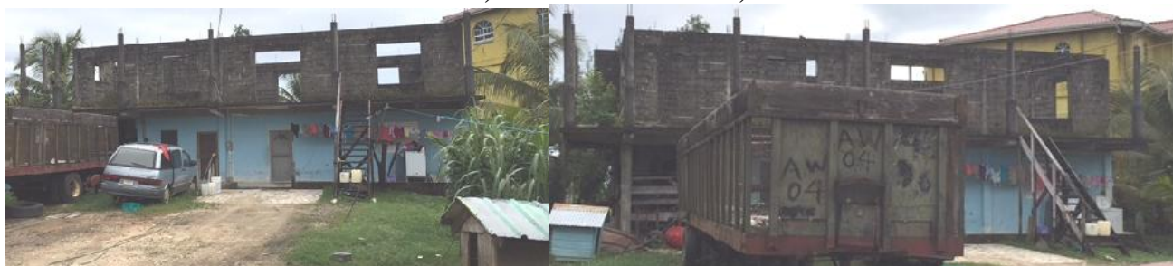
REGISTRATION SECTION BLOCK PARCEL Punta Gorda 42 907

(Being an incomplete two storey dwelling house [4,066 sq. ft.] containing Ground Floor: 3 bedrooms + 3 bathroom + living/dining/kitchen; First Floor incomplete] and lot 721.176 S.M.] situate on the north end of Main Street, Punta Gorda Town, Toledo District, the freehold property of Ms. Phillipa Williams)