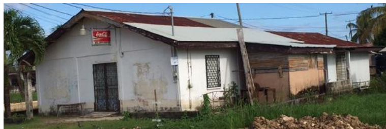
REGISTRATION SECTION BLOCK PARCEL Punta Gorda 42 342