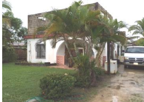
REGISTRATION SECTION BLOCK PARCEL Punta Gorda 42 1789/1

(Being an incomplete 2 storey concrete dwelling house, Ground floor 3 bedrooms + 2 bathrooms + living/dining/kitchen; First Floor 30% completed and lot [464.576 S.M.] situate on Santa Maria Street, Indianville Area, Punta Gorda, Toledo District, the leasehold property of Mr. Antonio Teul)