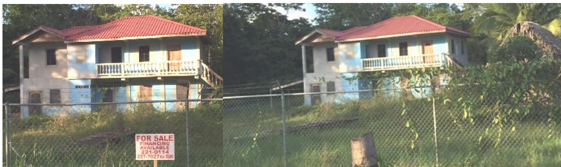
REGISTRATION SECTION BLOCK PARCEL Big Falls/Golden Stream 42 577

(Being a two storey concrete building [2,200 sq. ft.] containing Ground Floor: Preparation & Storage Facility; First Floor: 3 bedrooms + 1 bathroom + Living/Dining/Kitchen + Small timber & thatch Kitchen and lot 2,642.62 S.Y. situate in San Miguel Village in the Big Falls/Golden Stream Area, Toledo District, the freehold property of Mr. Mariano Kus)