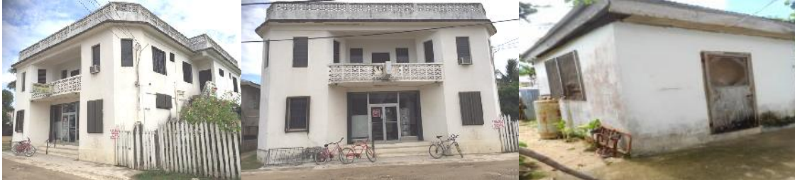
REGISTRATION SECTION BLOCK PARCEL Dangriga South 31 444

(Being a two storey concrete commercial/residential building containing 4092 sq. ft: Ground Floor: commercial space + storage + ½ bathroom; First Floor: 5 bedrooms + 3 bathrooms + living + dining + kitchen + porch + balcony + roof access; laundry/utility room and lot [445.85 SM] situate at No. 543 Cedar Street, Dangriga, Stann Creek District, the freehold property of Mr. Ivan Ramos)