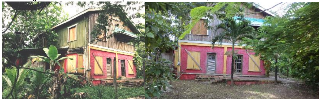
REGISTRATION SECTION BLOCK PARCEL Punta Gorda 42 737