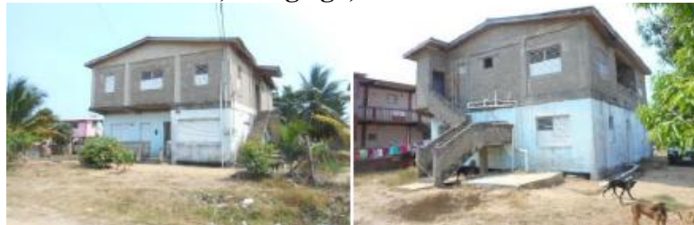
REGISTRATION SECTION BLOCK PARCEL Dangriga North 31 657

(Being a two storey concrete dwelling house [2,220 sq. ft.] containing Ground Floor - 3 bedrooms + 1 bathroom + living/dining/kitchen + covered verandah; First Floor 3 bedrooms + 1 bathroom + living/dining/kitchen + laundry + balcony and lot [754.546 S.M.] situate near the Melinda Road, Dangriga, Stann Creek District, the freehold property of Ms. Carol Aranda)