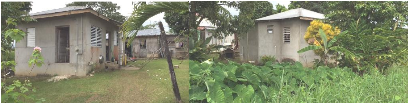
REGISTRATION SECTION BLOCK PARCEL Punta Gorda 42 450

(Being three buildings (1) concrete single family bungalow dwelling house (415 sq. ft.) containing 2 bedrooms + 1 bathroom + living/dining/kitchen; (2) a timber dwelling house (502 sq. ft.) and an outhouse/laundry (120 sq.ft.) situate on Filaya Street, Punta Gorda, Toledo District, the freehold property of Mr. Ernesto Canelo and Mr. Herman Canelo)