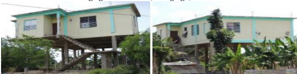
REGISTRATION SECTION BLOCK PARCEL Dangriga South 31 24/1

(Being a elevated concrete dwelling house [1,524 sq. ft.] containing 4 bedrooms + 2 bathrooms + living/dining/kitchen and lot [371.463 S.M.] situate in Dangriga North Area, Dangriga, Stann Creek District, the leasehold property of Ms. Delsia Aranda)