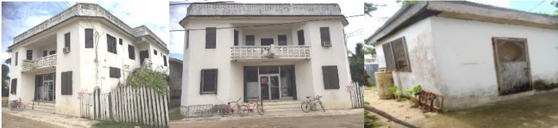
REGISTRATION SECTION BLOCK PARCEL Dangriga South 31 444

(Being a two storey concrete commercial/residential building containing 4092 sq. ft: Ground Floor: commercial space + storage + ½ bathroom; First Floor: 5 bedrooms + 3 bathrooms + living + dining + kitchen + porch + balcony + roof access; laundry/utility room and lot [445.85 SM] situate at No. 543 Cedar Street, Dangriga, Stann Creek District, the freehold property of Mr. Ivan Ramos)