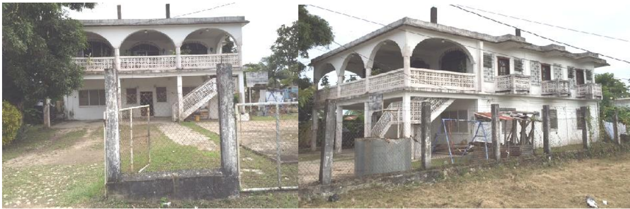
REGISTRATION SECTION BLOCK PARCEL Punta Gorda 42 793

(Being a two storey concrete building [5,640 sq. ft.] containing Ground Floor: 5 bedrooms + 3 bathrooms + living/dining/kitchen; First Floor 4 bedrooms + 2 bathrooms + living/dining/kitchen and lot [668.896 S.M.] situate on West Street, Punta Gorda Town, Toledo District, the freehold property of Mr. Aurelio Oliva)