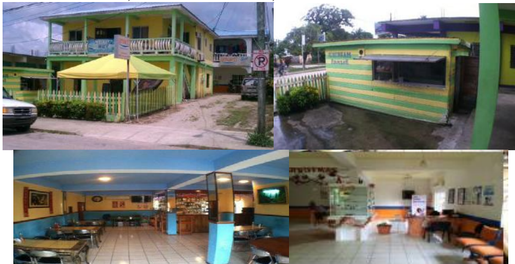
REGISTRATION SECTION BLOCK PARCEL Punta Gorda 42 614

(Being a two storey concete commercial/residential building used as a restaurant on the ground floor and a residence containing 3 bedrooms + 1 bathroom + living/dining/kitchen and a another two storey concrete commercial building containing commercial space on the ground floor and 4 bedrooms + 1 bathroom + open space and a timber structure used as a store together with lot [824.79 S.Y.] situate on Main Street, Punta Gorda Town, the freehold property of Messrs. Galvez Taxi & Tours (Mr. Carlos Glavez and Ms. Florence Galvez) [Photos taken July 14 2013]