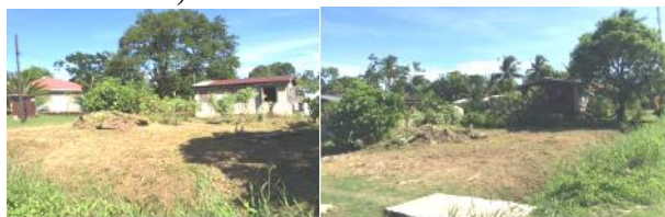
REGISTRATION SECTION BLOCK PARCEL Punta Gorda 42 272