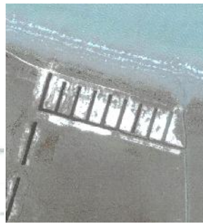
REGISTRATION SECTION Sibun Bight