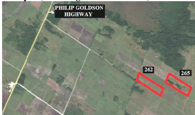
REGISTRATION SECTION Ramonal Zapote/S.E.