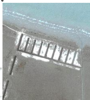
REGISTRATION SECTION Sibun Bight