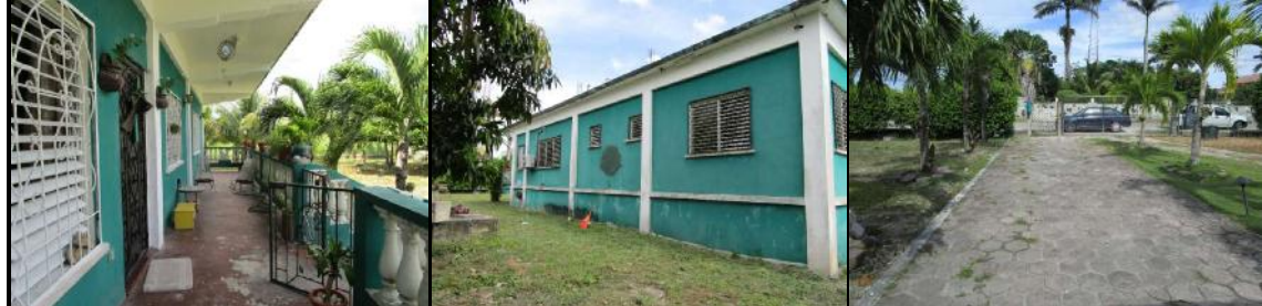
REGISTRATION SECTION Orange Walk Town