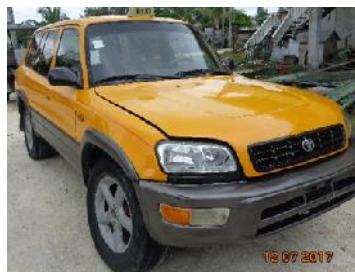
1999 Toyota Rav 4

VEHICLE: Available for viewing in San Pedro, Ambergris Caye prior to sale