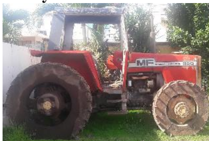
1991 Massey Ferguson 590 Tractor