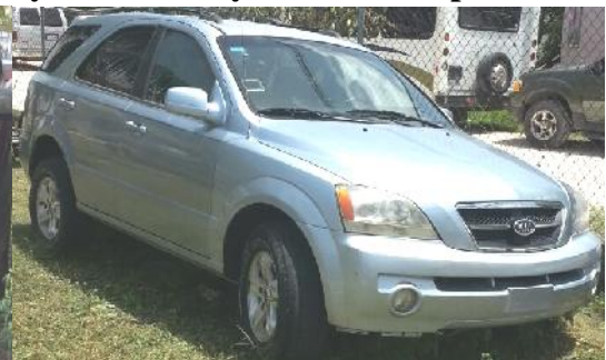
2005 Blue Kia Sorento