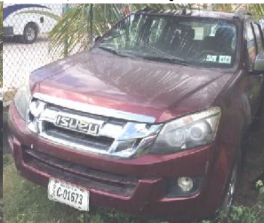
2013 Isuzu D-Max