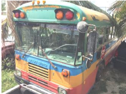
1992 Blue Bird Bus