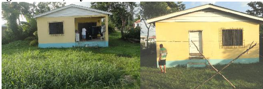
REGISTRATION SECTION San Ignacio North