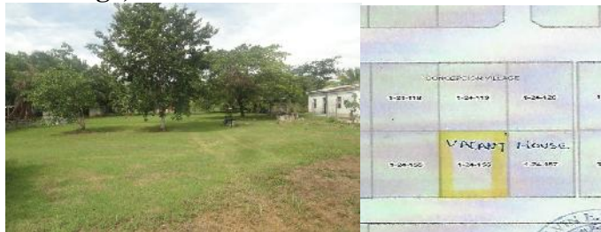
REGISTRATION SECTION BLOCK PARCEL Concepcion Village 1 156