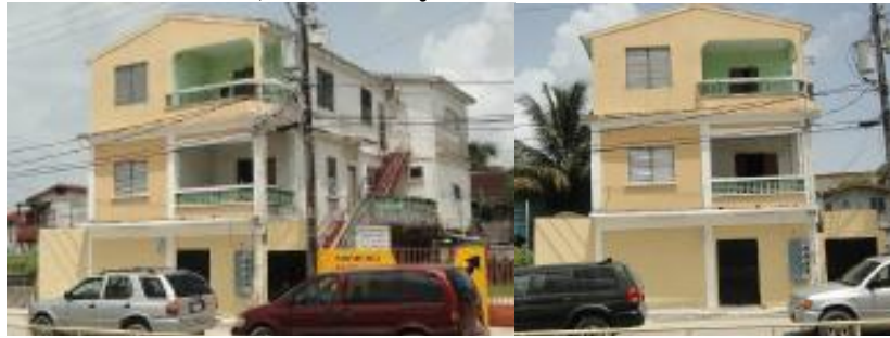
REGISTRATION SECTION Albert/Mesop