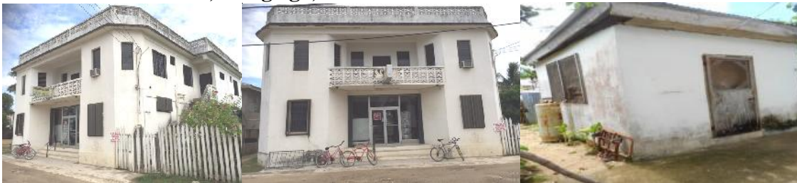
REGISTRATION SECTION BLOCK PARCEL Dangriga South 31 444

(Being a two storey concrete commercial/residential building containing 4092 sq. ft: Ground Floor: commercial space + storage + 1/2 bathroom; First Floor: 5 bedrooms + 3 bathrooms + living + dining + kitchen + porch + balcony + roof access; laundry/utility room and lot [445.85 SM] situate at No. 543 Cedar Street, Dangriga, Stann Creek District, the freehold property of Mr. Ivan Ramos)