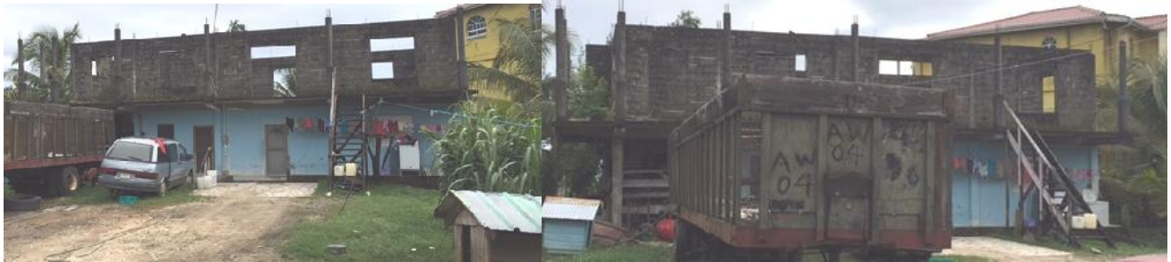
REGISTRATION SECTION BLOCK PARCEL Punta Gorda 42 907

(Being an incomplete two storey dwelling house [4,066 sq. ft.] containing Ground Floor: 3 bedrooms + 3 bathroom + living/dining/kitchen; First Floor incomplete] and lot 721.176 S.M.] situate on the north end of Main Street, Punta Gorda Town, Toledo District, the freehold property of Ms. Phillipa Williams)