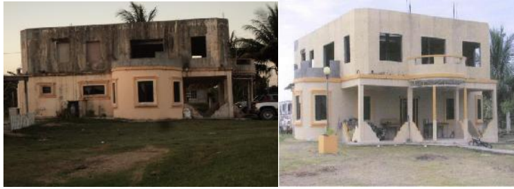
REGISTRATION SECTION BLOCK PARCEL Libertad Village 1 682

(Being a 2 storey concrete structure with [3,335 sq. ft.] – Ground Floor - contains 2 bedrooms + 1 bathroom + living/kitchen area. Second Floor is incomplete. Situated in Libertad Village, Corozal being the Freehold property of Mr. Heraan Botes)