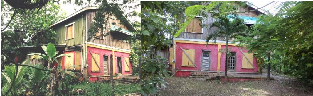
REGISTRATION SECTION BLOCK PARCEL Punta Gorda 42 737