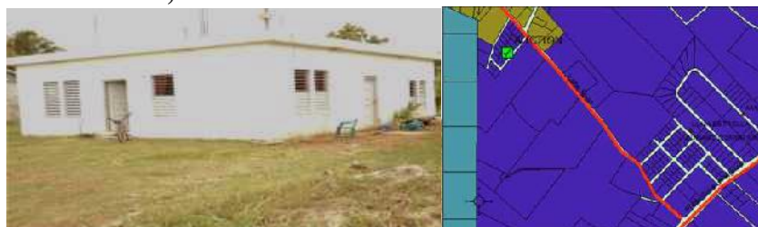
REGISTRATION SECTION BLOCK PARCEL Carolina/Calcutta 1 28

Being an incomplete concrete building 1 bathroom + living/dining/kitchen + incomplete bedrooms and