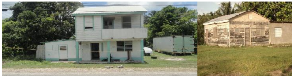
REGISTRATION SECTION BLOCK PARCEL Libertad Village 1 552

(Being Building No. 1: 2 storey structure with [2,862 sq. ft.] – Ground Floor – concrete and contains 3 bedrooms + 2 bathrooms + living/dining/kitchen area + laundry room and porch. Second Floor- is wooden with 4 bedrooms + 1 bathroom and porch area. Building No. 2 mixed structure with [672 sq. ft.] – contains 3 bedrooms + kitchen/dining/living area situated in Libertad Village, Corozal being the freehold property of Mr. Emilio & Mrs. Melva Sarmiento (Emilia & Baldominio Montejo)