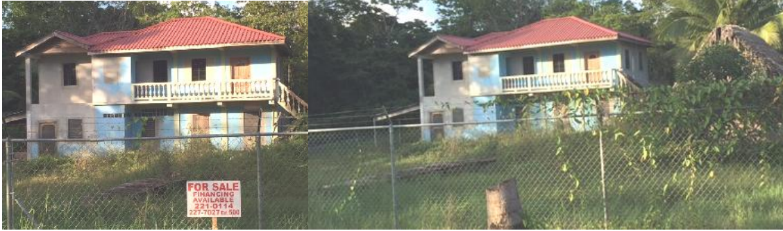
REGISTRATION SECTION BLOCK PARCEL Big Falls/Golden Stream 42 577

(Being a two storey concrete building [2,200 sq. ft.] containing Ground Floor: Preparation & Storage Facility; First Floor: 3 bedrooms + 1 bathroom + Living/Dining/Kitchen + Small timber & thatch Kitchen and lot 2,642.62 S.Y. situate in San Miguel Village in the Big Falls/Golden Stream Area, Toledo District, the freehold property of Mr. Mariano Kus)