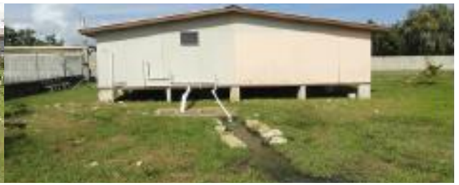
REGISTRATION SECTION Vista del Mar