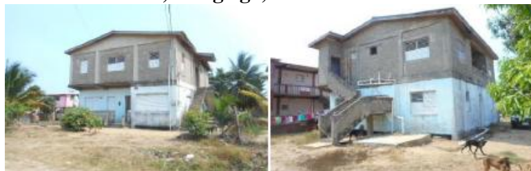
REGISTRATION SECTION BLOCK PARCEL Dangriga North 31 657

(Being a two storey concrete dwelling house [2,220 sq. ft.] containing Ground Floor - 3 bedrooms + 1 bathroom + living/dining/kitchen + covered verandah; First Floor 3 bedrooms + 1 bathroom + living/dining/kitchen + laundry + balcony and lot [754.546 S.M.] situate near the Melinda Road, Dangriga, Stann Creek District, the freehold property of Ms. Carol Aranda)