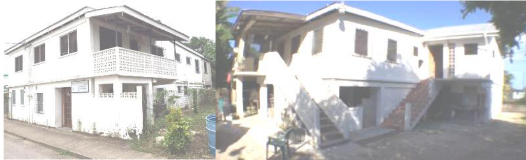
REGISTRATION SECTION Punta Gorda

(Being a two storey concrete building [2,200 sq. ft.] containing Ground Floor: Preparation & Storage Facility; First Floor: 3 bedrooms + 1 bathroom + Living/Dining/Kitchen + Small timber & thatch Kitchen and lot 2,642.62 S.Y. situate in San Miguel Village in the Big Falls/Golden Stream Area, Toledo District, the freehold property of Mr. Mariano Kus)