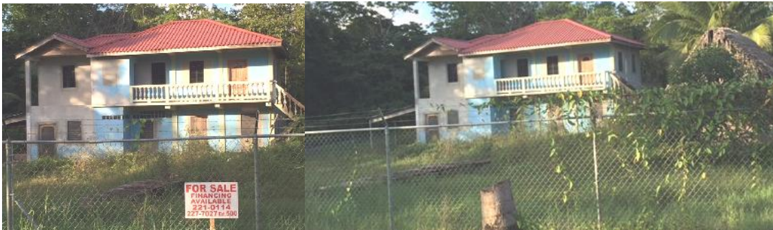
REGISTRATION SECTION Big Falls/Golden Stream

(Being a single-family dwelling house [1,882 sq. ft.] containing 3 bedrooms + 2 bathrooms + Living/dining/kitchen + Entry Verandah + Covered Carport + Second Floor: Game Room + Covered Patio and lot 977.04 S.M. situate in the Forest Home Village Extension, Toledo District, the freehold property of Mr. David Duncan)