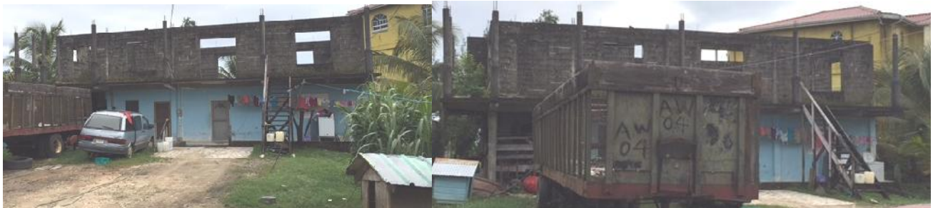
REGISTRATION SECTION Punta Gorda

(Being a two storey concrete building [2,932 sq. ft.] containing Ground Floor: Commercial Office; First Floor: 4 bedrooms + 1 bathroom + Kitchen and lot 857.23 S.Y. situate No. 11 Front Street, Punta Gorda Town, Toledo District, the freehold property of Mr. Lincoln Pascasio)