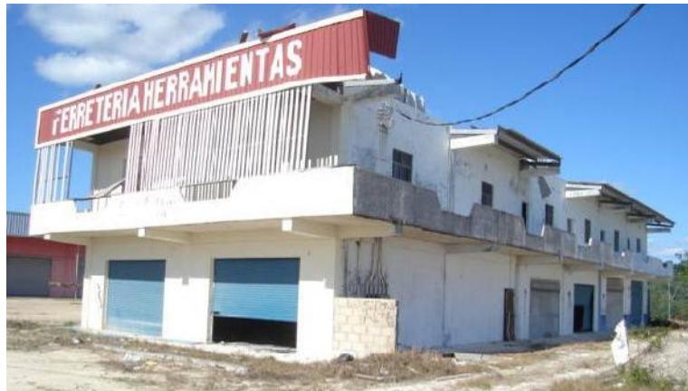
REGISTRATION SECTION Santa Elena