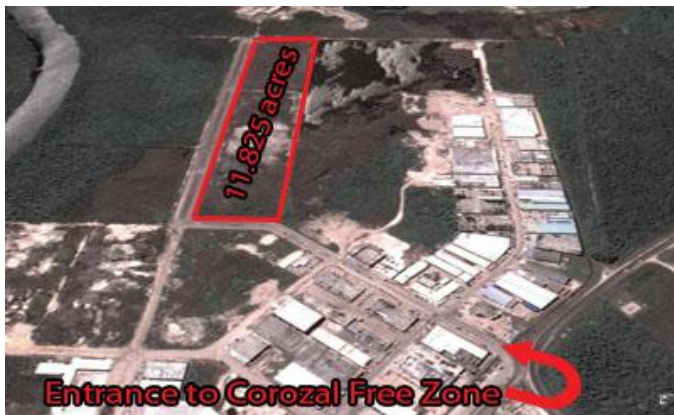
REGISTRATION SECTION Santa Elena