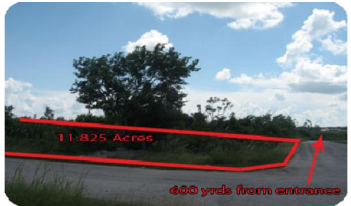
BLOCK 1 PARCELS 647 to 736

(Being a vacant parcel of land situate near the Commercial Free Zone area, Santa Elena, Corozal District containing 11.825 acres, the freehold property of Messrs. Universal Imports Limited, surety for Messrs. Northern Data Processing)