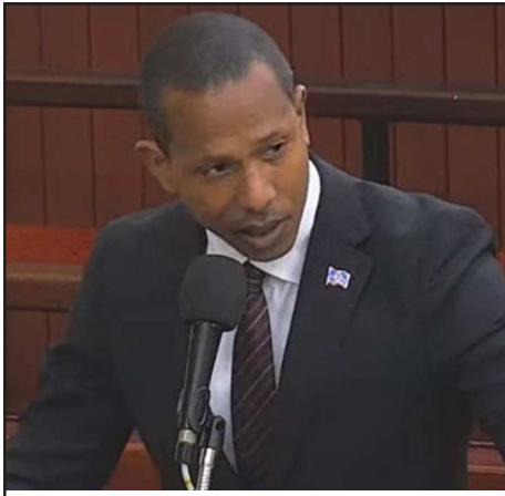
Hon. Moses “Shyne” Barrow

Hon. Moses “Shyne” Barrow stated in the House of Representatives that the $1.3 billion budget “misprioritizes” funds, but Prime Minister Briceño argued that the LOO’s critiques lack “shame and common sense”.