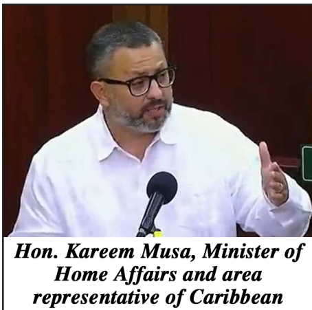
Hon. Kareem Musa, Minister of Home Affairs and area representative of Caribbean

Minister of Home Affairs, Kareem Musa, announced that the Leadership Intervention Unit (LIU) will be receiving $2.9 million from GoB for projects for at-risk youth in Southside Belize City.