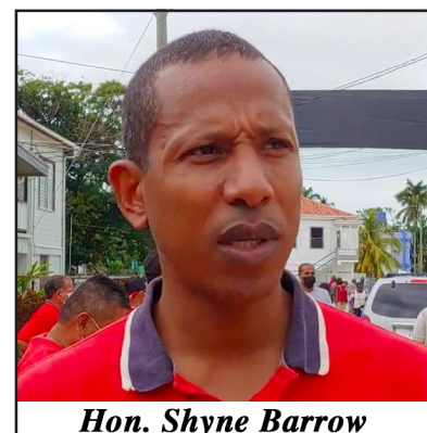
Hon. Shyne Barrow