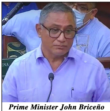
Prime Minister John Briceño