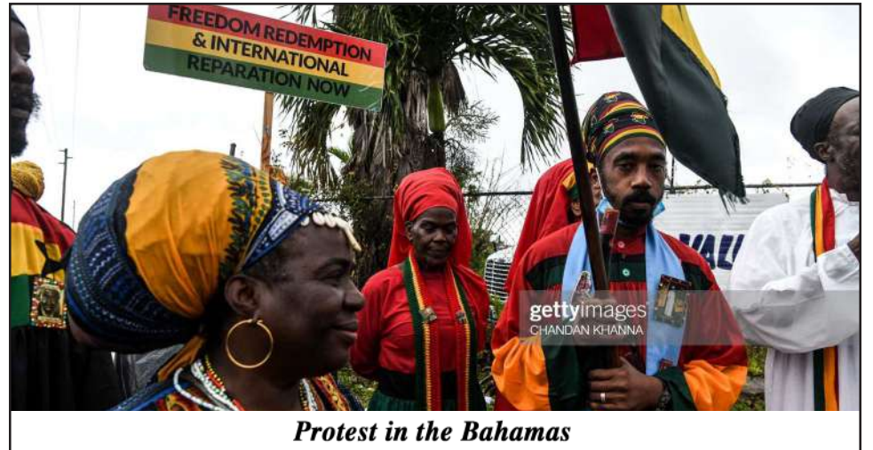
Protest in the Bahamas

The royal visit of the Duke and Duchess of Cambridge, Prince Williams and his wife Kate, came to an end with a visit to the Bahamas, where they were once again met by protest from residents. This time, the Rastafarian community in the country attempted to stage a protest in front of a primary school that the couple visited. They were reportedly removed from the area by police. In his remarks during a state dinner in Jamaica, Prince William aligned himself with the sentiments of his father, Prince Charles, who during a ceremony in Barbados at which the island officially became a republic, said, "the atrocity of slavery forever stains our history". During his