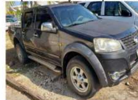
2014 Great Wall Wingle 5