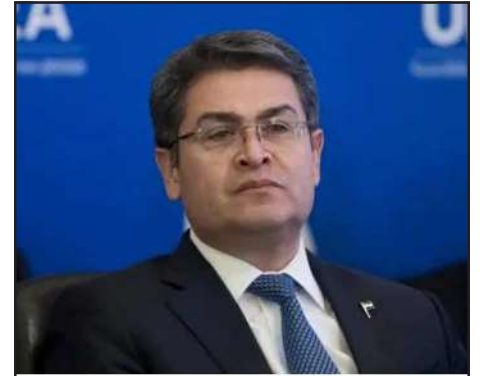
Juan Orlando Hernandez, former two-term president of Honduras