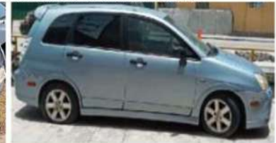
2006 Suzuki Aerio