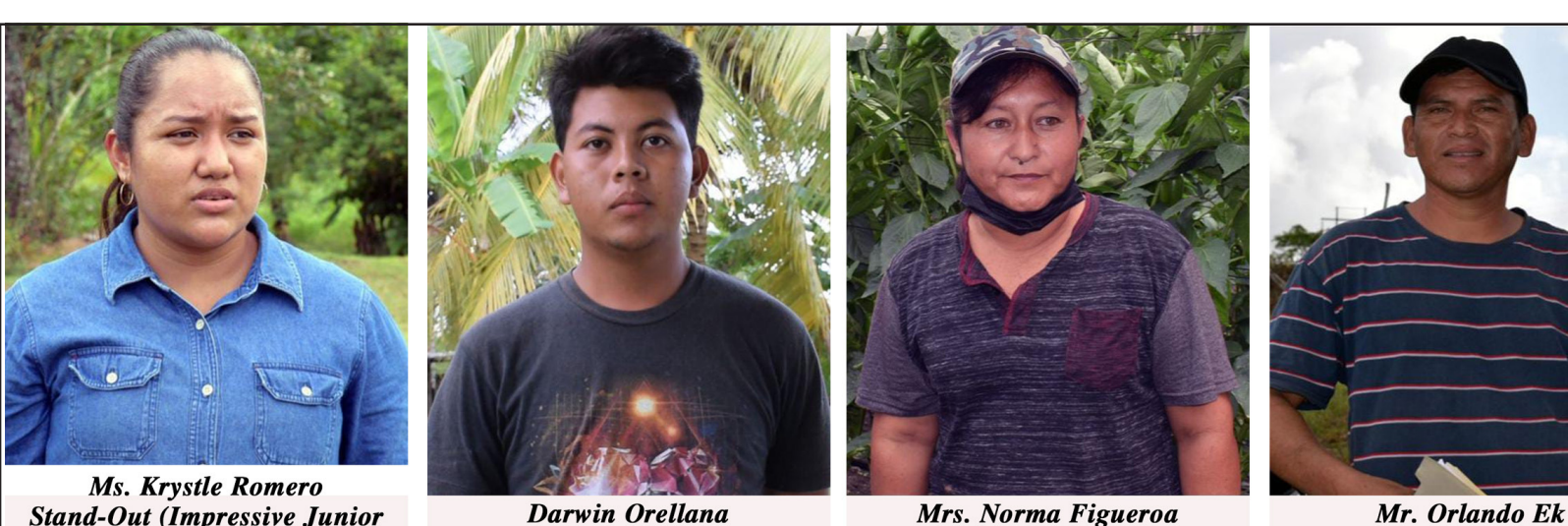
Stand-Out (Impressive Junior Farmer) 2022

The National Agriculture and Trade Show will be held later this month after a two-year hiatus, under the theme, "Innovations in Technology: Driving a Climate of Resilient and Competitive Agriculture and Food Sector", and in conjunction with the announcement of that theme, the committee has released the