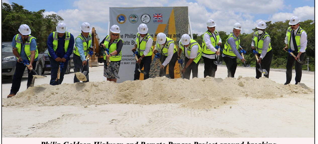
Philip Goldson Highway and Remate Bypass Project ground-breaking

carried out by the Ministry of Infrastructure and Development through