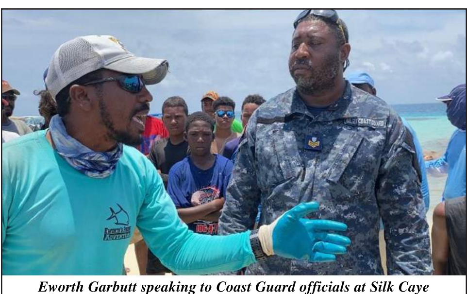
. . .