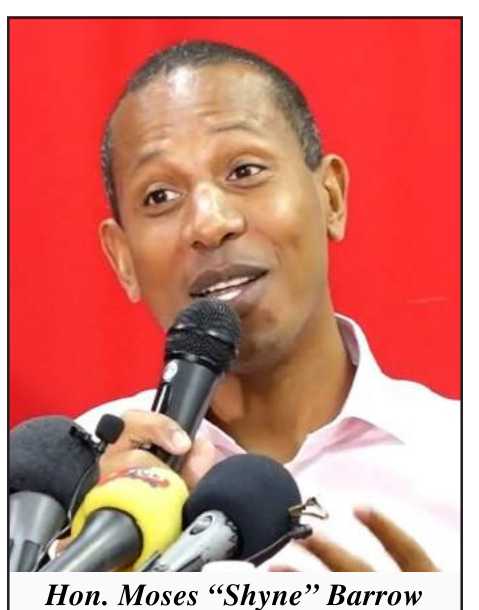
by Khaila Gentle