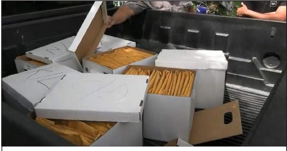
Churches take petition signatures to the GG

"Under Section 2 of the Referendum Act, signatures have been submitted to the Governor-General to commence the process of issuing a Writ of Referendum. Over the last year and four months, the government has repeatedly demonstrated its good faith and commitment to the consultation process in relation to the passage of the Cannabis and Industrial Hemp Control and Licensing Bill," stated the release.