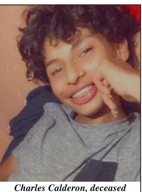
by Khaila Gentle