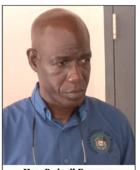
Hon. Rodwell Ferguson, Minister of Youth and Sports