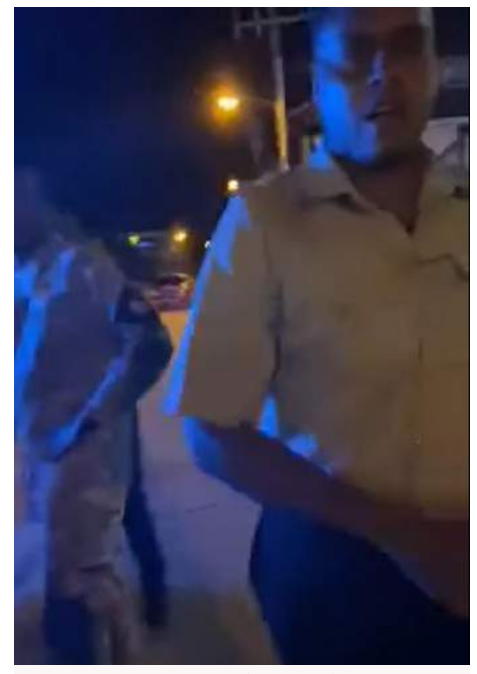
Cop assaults civilian

He further stated, "What we're hoping for [is] that the person in that video would come forward and give us a formal report, but I can tell you on our side. One, our legal office has already made certain directives and