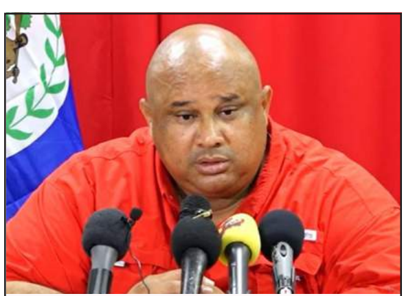
Senator Michael Peyrefitte, UDP Chairman and Shadow Minister for National Security

On Wednesday, May 4, the United Democratic Party (UDP) held a press conference to address some of the major issues and challenges facing the country.