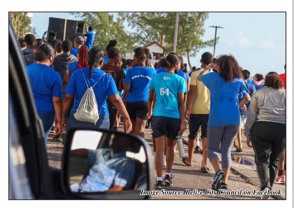
by Khaila Gentle