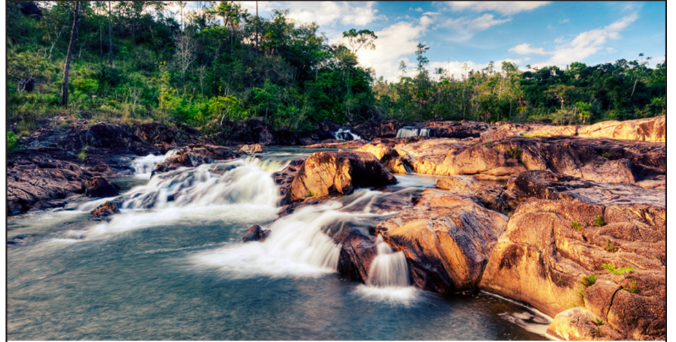
Rio On Pools

The separate incidents occurred over the weekend and claimed the life of an 8-year-old girl, and a 6-year old boy