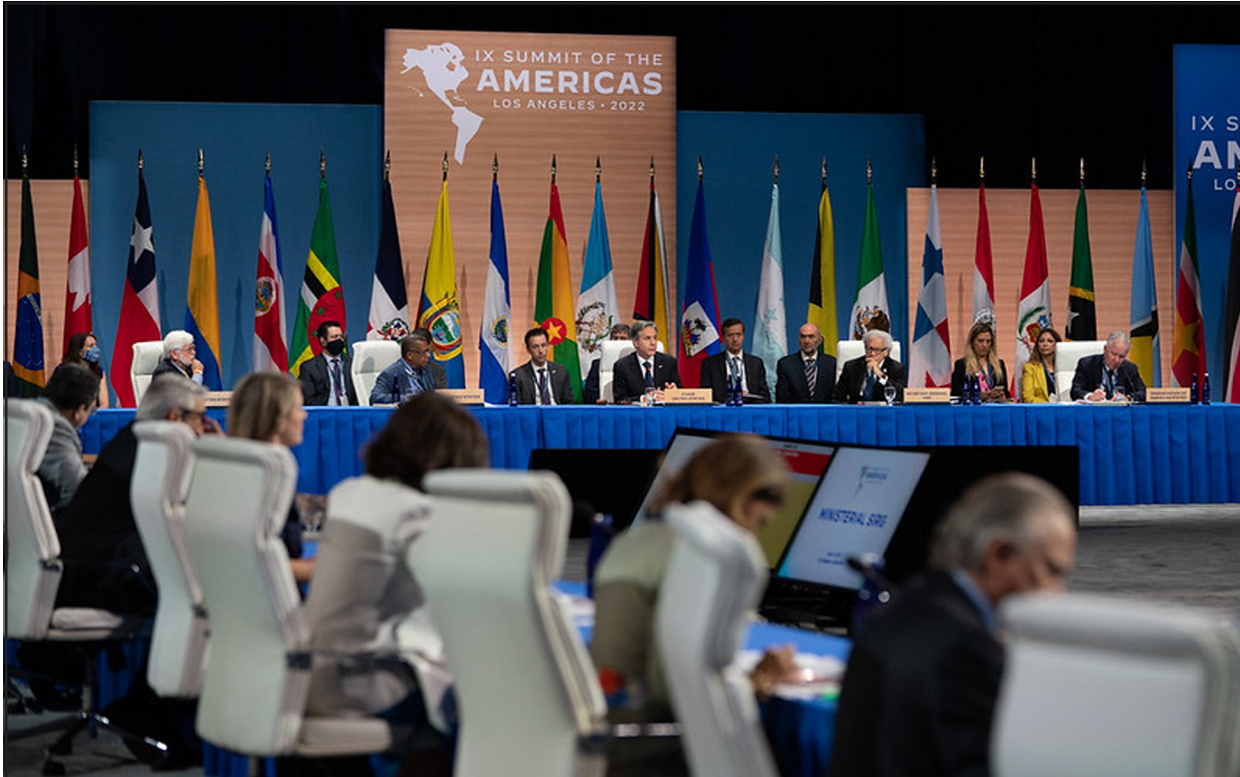
IX Summit of the Americas

“It is vital that we sever the connection between the war and the production, exportation, and supply of food. The right to food is sacred. We must ensure access to financing for our 26.5 million farmers, particularly small farmers,” said the Director-General.