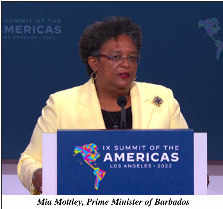
Mia Mottley, Prime Minister of Barbados

“I chose the language of Bob Marley this morning, not because I am an apostle of Bob, as you probably have realized by now, but also because it reminds us of the day-to-day reality of our people and of our citizens, and we have come to Los Angeles hopeful that