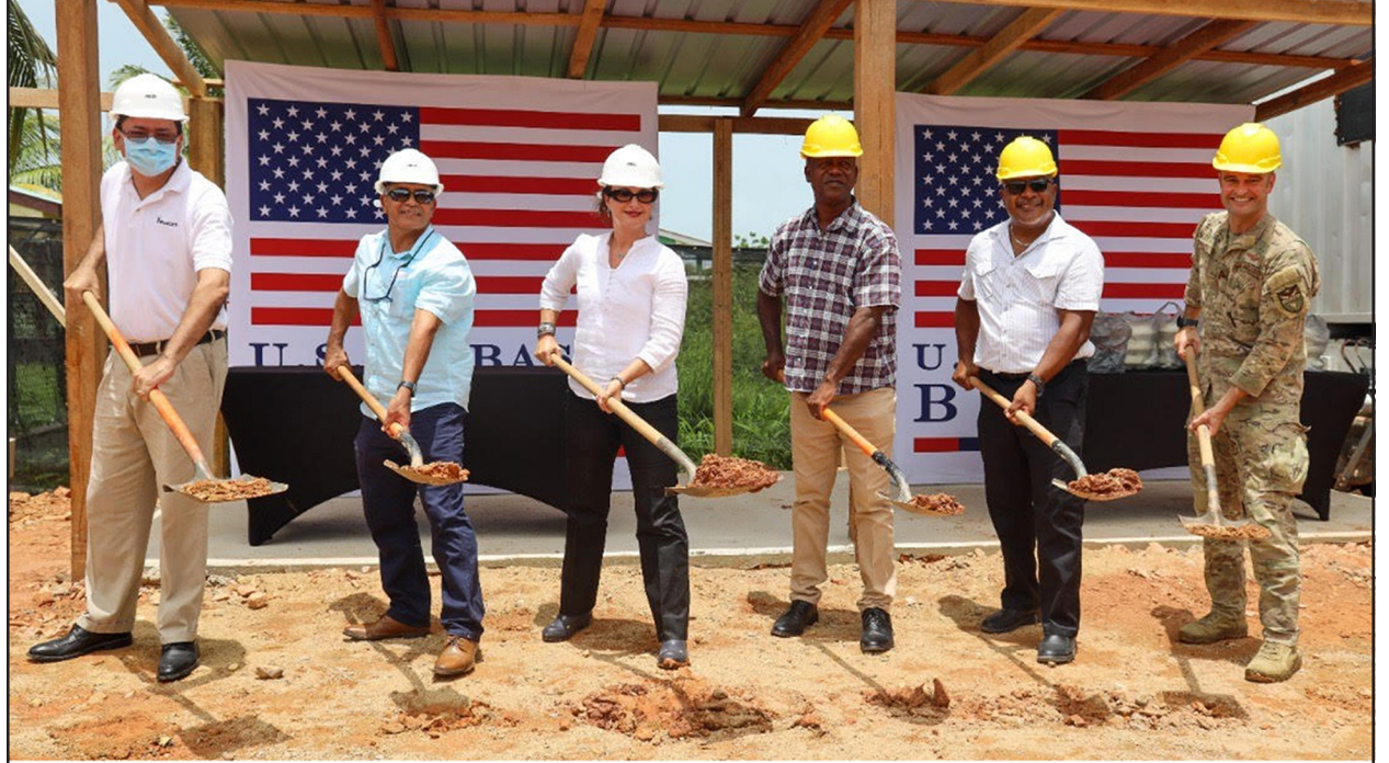
Groundbreaking for US-funded Dangriga fire station

the community of Dangriga are most grateful to have this groundbreaking for this state-of-the-art fire station that is going to be built here in Dangriga due to the generosity of the government and the people of the United States. So today, we had this groundbreaking ceremony and we expect that within a year or so, the facilities will be built ... so that will significantly improve the effectiveness of the firefighters here in Dangriga to be able to respond to emergencies that