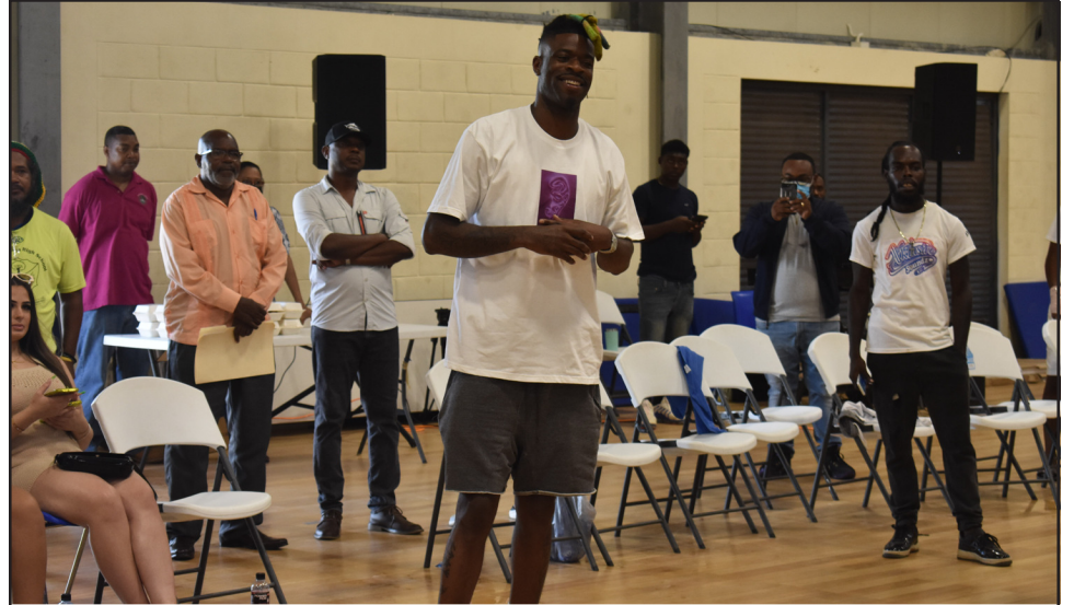
Reggie Bullock, shooting guard for the Dallas Mavericks

Reggie Bullock, shooting guard for the Dallas Mavericks, visits Belize