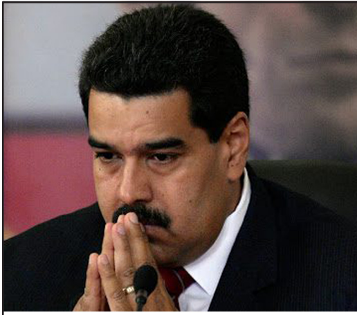
Venezuelan president, Nicolas Maduro

In May of this year, the Biden administration took steps to loosen the sanctions on the Maduro administration in order to foster talks between Maduro and US-backed opposition leader Juan Guaido. The resumption of business