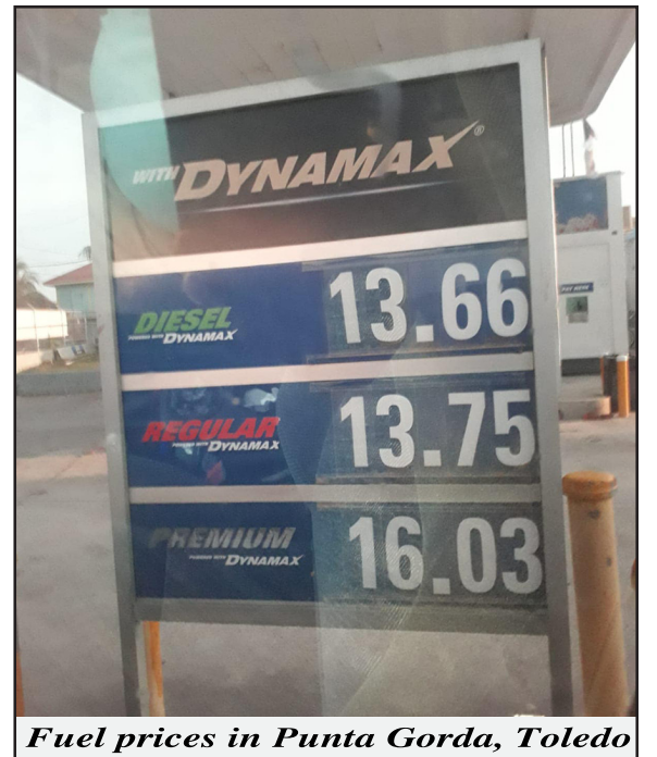
Fuel prices in Punta Gorda, Toledo

Over the last few months, the government of Belize, in the face of public outcry and heavy criticism of the administration following the issuance of any release announcing a hike in the price of fuel, has not been issuing such releases to notify the public of changes in fuel prices, as had been typically done for a number of years. It was thus a social media post by the Albert Division area representative, Hon. Tracy Panton, that made the public aware that the cost of premium fuel is currently $16.03 at a gas station in Toledo.