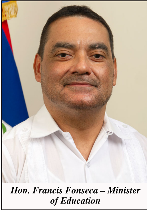
Hon. Francis Fonseca – Minister of Education

Today, Minister of Education, Hon. Francis Fonseca announced that a loss-mitigation summer school program would be launched across the country to address the learning setbacks suffered by students as a result of the two-year lapse in classroom (in-person) learning due to the COVID-19 pandemic. With a majority of students back in classrooms in the latter part of this school year, the ministry has identified learning gaps using the Belize Diagnostic Assessment Test (B-DAT) , and is now taking steps to address them. According to Minister Fonseca, retired and highly skilled and experienced teachers will be utilized on the front lines during the summer program and will work in specific problem areas to get students to reach the necessary educational level prior to the next school year.