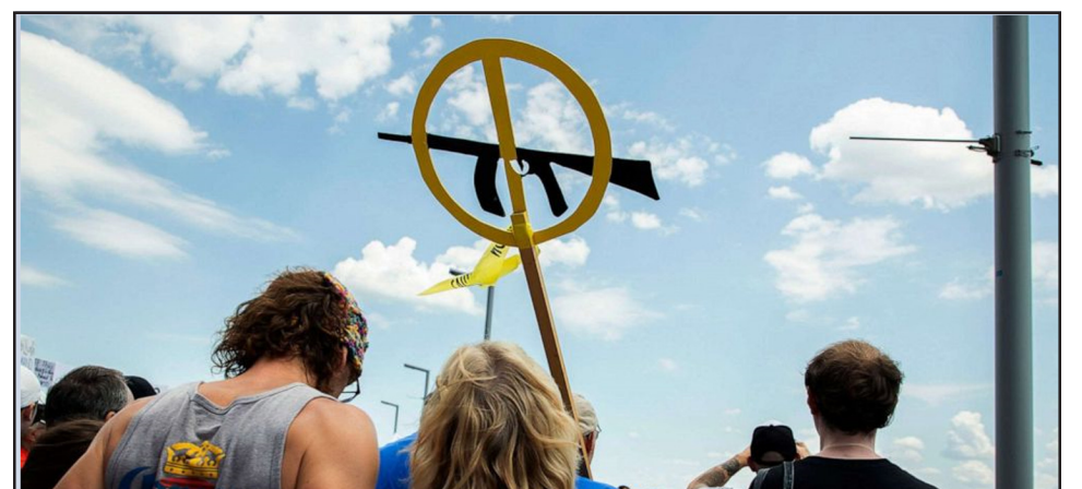
People fill Detroit Cities Riverfront as they listen to speakers and march in the March for Our Lives Detroit event demanding gun control laws in Detroit, June 11, 2022.

Indiana nightclub shooting leaves 2 dead, 4 injured A man and a woman were killed and four patrons were injured when gunfire erupted early Sunday at a nightclub in Gary, Indiana, according to police.