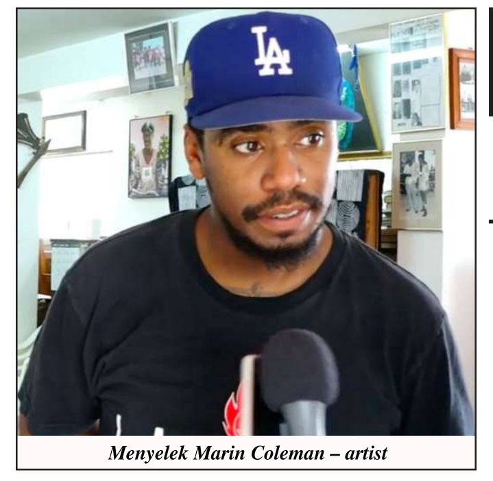
BELIZE CITY, Mon. June 4, 2022