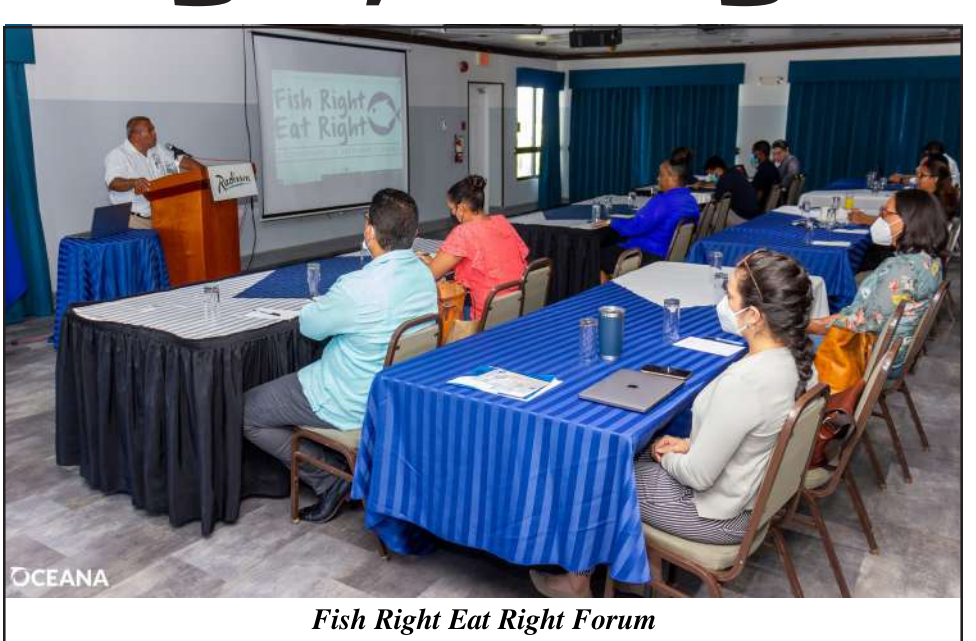
by Charles Gladden