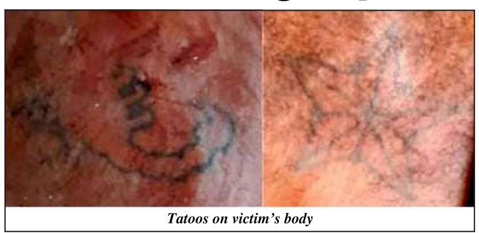
by Charles Gladden