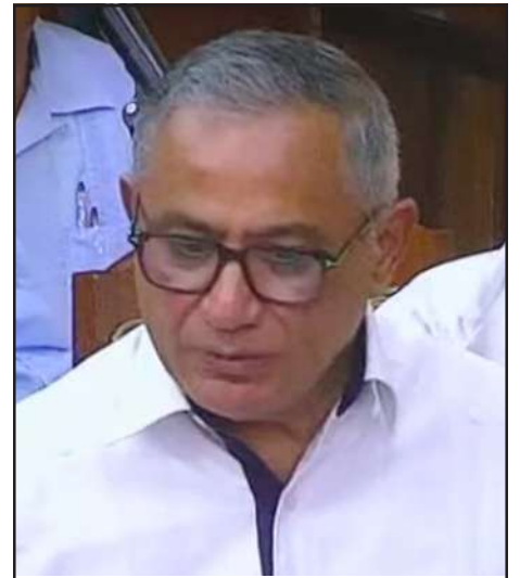
Prime Minister Hon. John Briceño

The debate quickly devolved into a back and forth between sides following a discussion on the former leader of the UDP Rt. Hon. Dean Barrow's admission a few weeks earlier that he was aware of rampant corruption in the