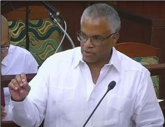
Leader of Government Business, Hon. Eamon Courtenay