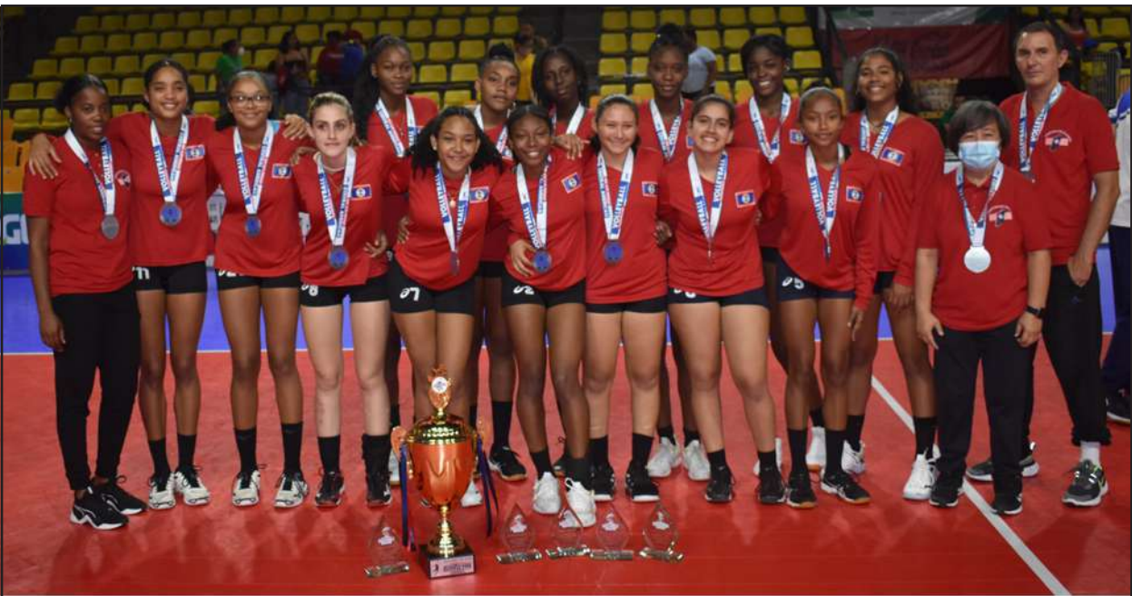
Belize's U21 Women's Volleyball team wins silver