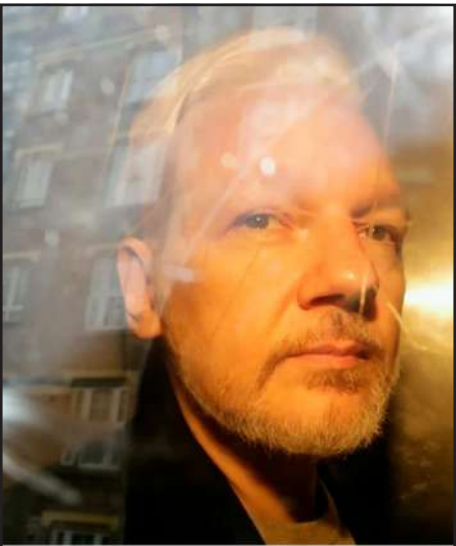
Julian Assange has appealed

The Australian government has been under mounting pressure to intervene, but last month Prime Minister Anthony Albanese rejected calls for him to publicly demand that Washington drop its