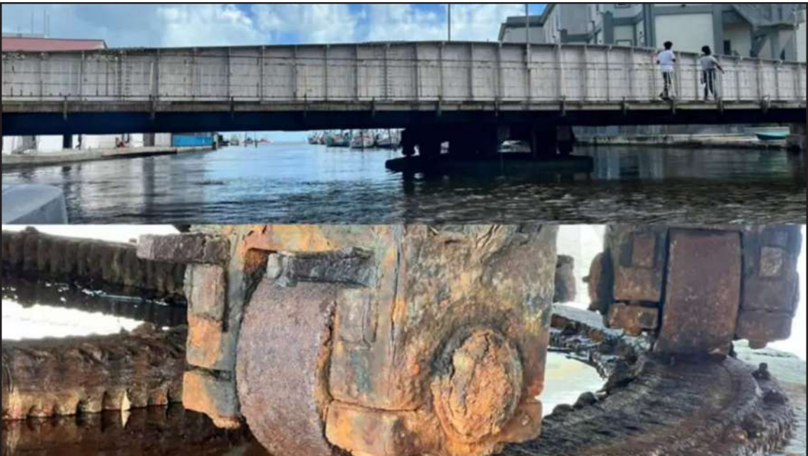
Condition at Swing Bridge

Back in May, Minister Espat told local reporters that his ministry was carrying out some assessment of the conditions of the three major bridges in Belize City. And when the local media met with Minister Espat after the House of Representatives meeting on Friday, he explained, "I had commissioned the engineers from the ministry to do an analysis of all the bridges in Belize City. A