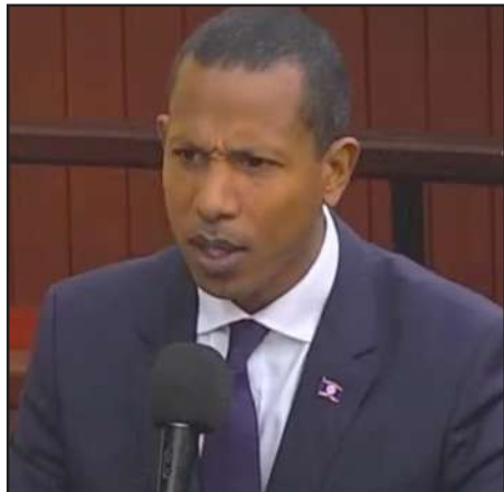
Moses "Shyne" Barrow, Leader of the Opposition

A question posed by the Leader of the Opposition, Hon. Moses "Shyne" Barrow, during Friday's sitting of the House of Representatives that seemed aimed at pushing the government to expedite approval of the Waterloo Investment Holdings' cruise terminal project—despite considerable environmental and community concerns surrounding the project—has been referred to by Prime Minister Hon. John Briceño as an effort by Hon. Barrow to sing "for his supper". Barrow