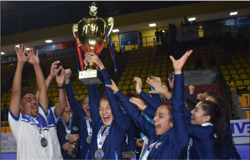
Guatemala wins Gold