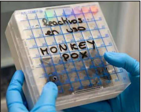
Monkey Pox vaccines