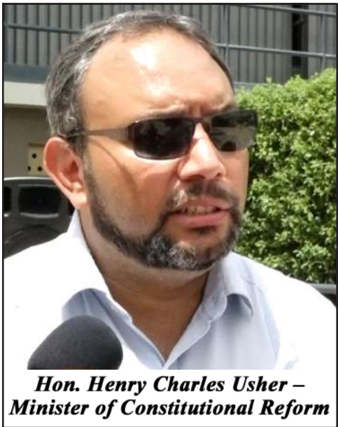
Hon. Henry Charles Usher – Minister of Constitutional Reform