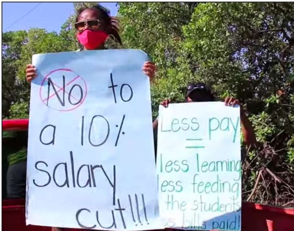
Teacher protesting salary cuts in 2021