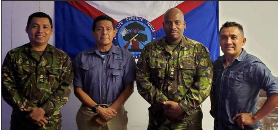
Members of Friends for Conservation and Development (FCD) and Belize Defence Force meet

The establishment of cattle ranching fields by Guatemalans on Belizean territory is well-documented, and decisive actions are now required.