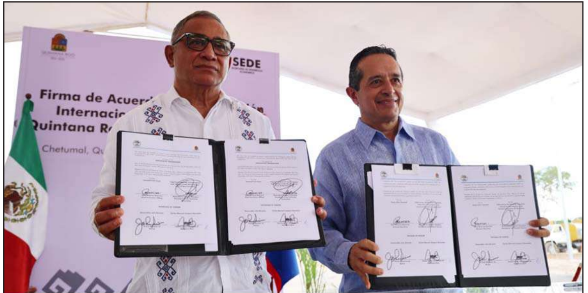
Signing of two Memoranda of Business between Belize and Quintana Roo, Mexico. (l-r) Prime Minister John Briceño and Governor Carlos González

Two MOUs signed between Belize and the State of Quintana Roo, Mexico, will establish more extensive business links between the two countries, and create a route for the export of Mexican products to the Caribbean