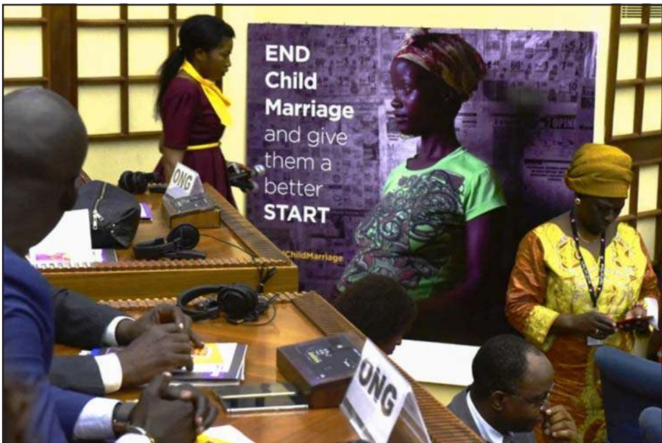
The number of people trapped in forced labour or forced marriage has swelled to about 50 million on any given day, the International Labour Organization says

The pandemic, armed conflicts, and climate change have exacerbated conditions, trapping people in forced labour or marriage.