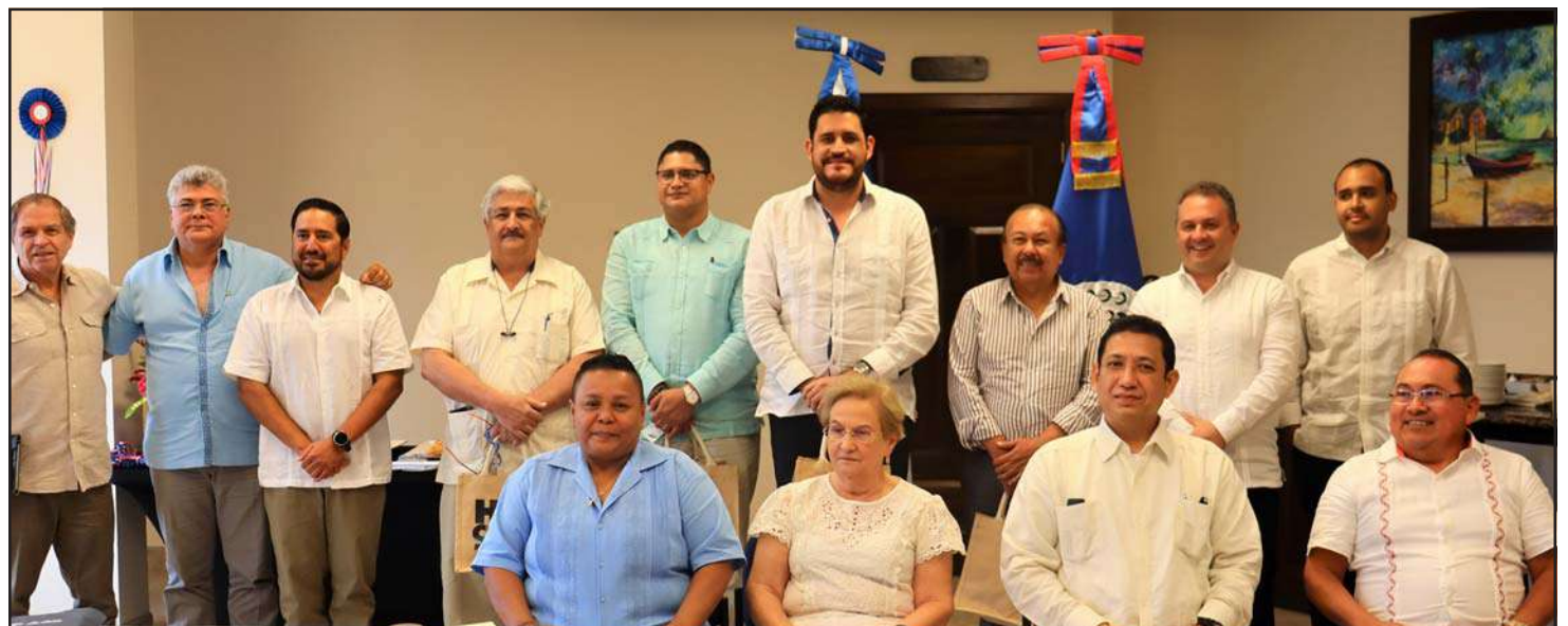
244th Regional Board meeting of COCESNA held in San Pedro, Belize

non-cooperating aircraft and assist in the fight against narco-trafficking in Belize and the region," a release from the Government of Belize states.