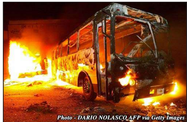
Burning bus following accident in Mexico

MEXICO CITY, Mon. Sept. 12, 2022 Mexican authorities are currently investigating a traffic accident that caused mass casualties on Saturday after a bus and a double-tanker fuel truck collided on the highway between Ciudad Victoria and Monterrey. A total of 20 persons were killed in the tragic accident. The bus was coming from the Hidalgo area en route to Monterrey, the capital of Nuevo Leon, when the accident took place in the border state of Tamaulipas. The burning vehicles made rescue efforts difficult, with 18 victims identified in the original death toll. The following day, two more bodies were found, taking the number of victims in this accident to 20. The driver of the fuel tanker reportedly survived the ordeal and is currently under investigation. Reports are that one of the tanks being towed by his truck may have