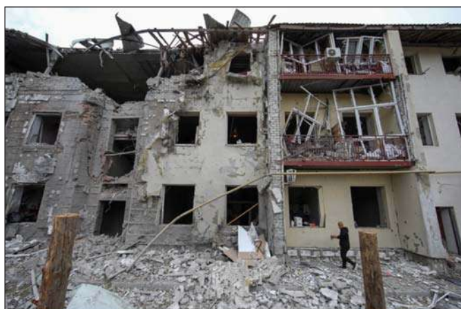
A man walks in a front of a residential building damaged by a Russian missile raid, amid Russia’s attack on Ukraine, in Kharkiv, Ukraine

“But on the other hand it’s a clear failure and Russia should change strategy. Many analysts here believe that Russia has to escalate its military operation in Ukraine