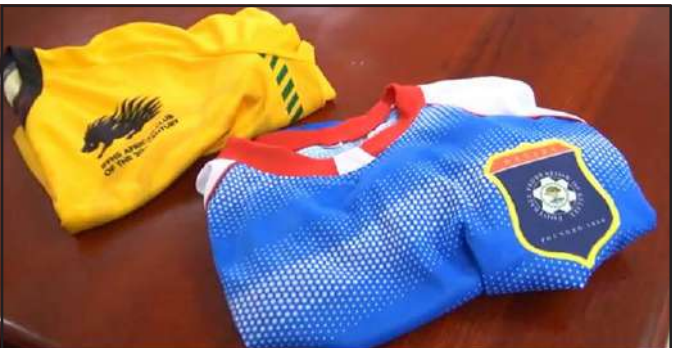
Belize and Kumasi Asante Kotoko Football uniforms

“FFB looks at the signing of this agreement as a significant step in the