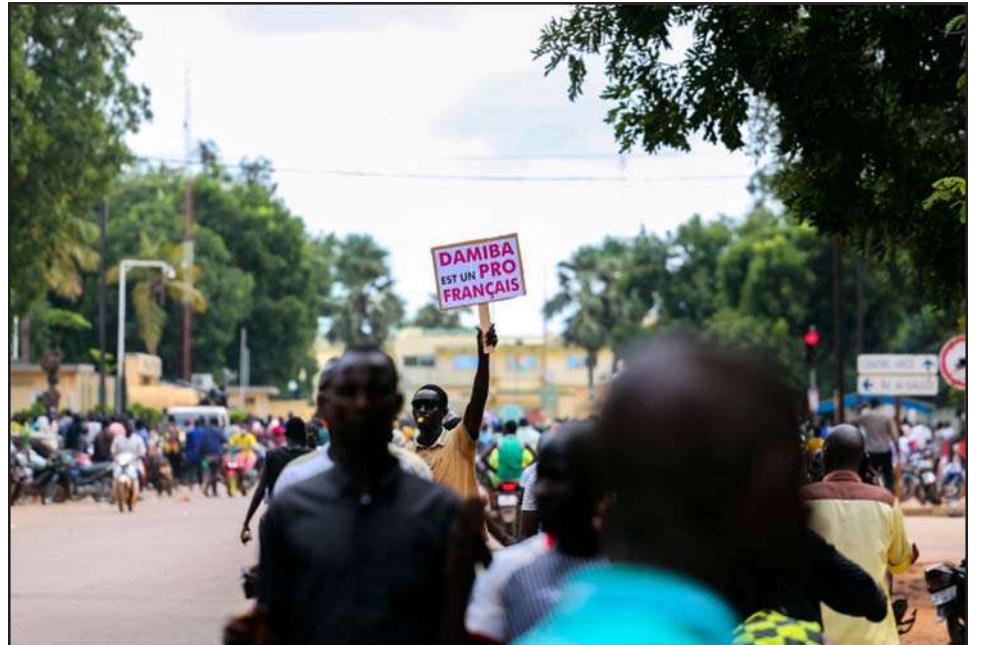
Supporters of coup maker Captain Ibrahim Traore rally in the streets of the capital Ouagadougou on Sunday, October 2, 2022

Paul-Henri Sandaogo Damiba offered his resignation in order to avoid confrontations with 'serious human and material consequences'.