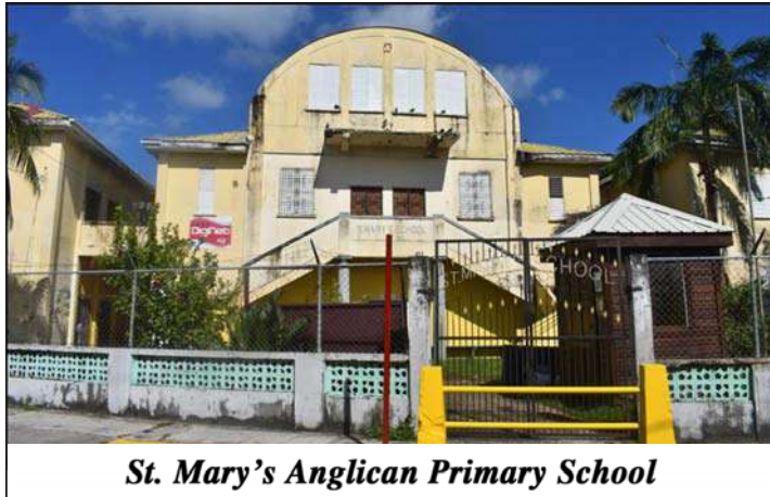
St. Mary's Anglican Primary School

When interviewed by local reporters yesterday, Minister of Education, Culture, Science and Technology, Hon. Francis Fonseca, informed the public that funds are being sought to assist in the rebuilding of St.