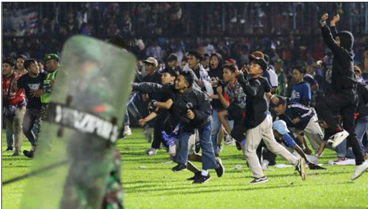
Deadly stampede at Kanjuruhan Stadium in Indonesia.

In response, riot police fired tear gas into the crowd, including towards the stadium bleachers, inciting panic. The ensuing stampede led to fans being trampled and suffocated as persons ran for the exits. Those among the casualties include two police officers and, according to Indonesia's Ministry for Women's Empowerment and Child Protection, 33