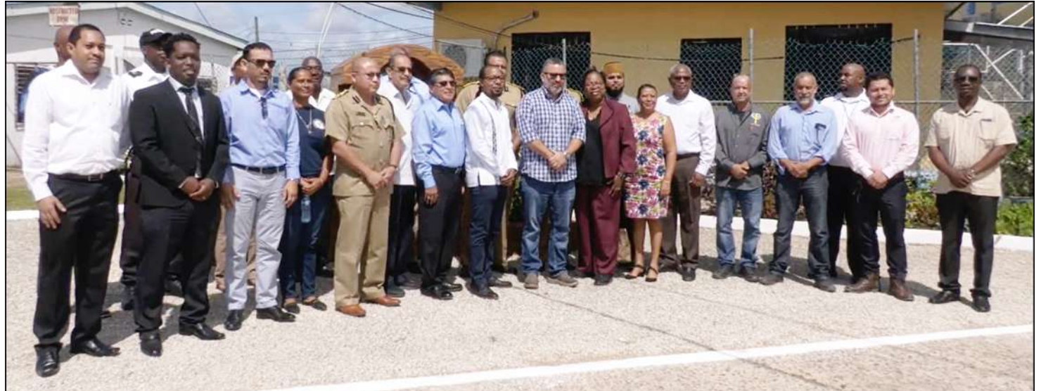
Visiting Justice Program returns

According to the CEO, Belize has been fortunate for the past fourteen years, since having the benefit of a prison run by a private-public partnership between the Kolbe Foundation and the Rotary Club of Belize allowed some of the prevailing issues that should have been tackled by the Visiting Justice Program to have been instead solved by the prison's administration.