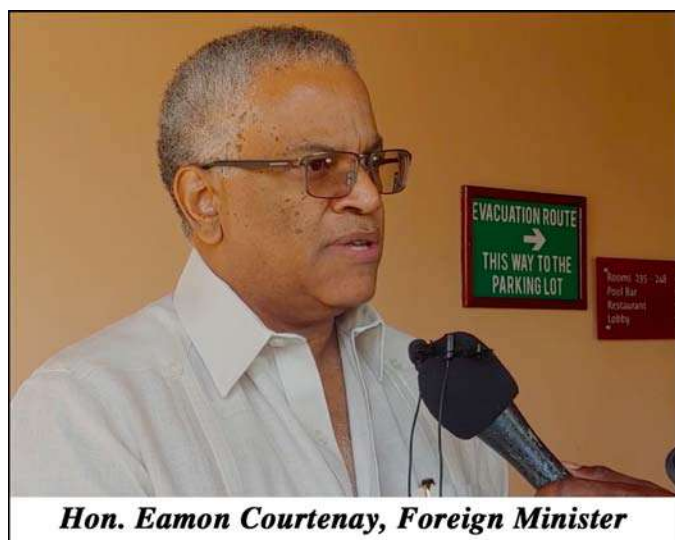
Hon. Eamon Courtenay, Foreign Minister