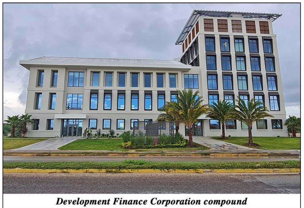
Development Finance Corporation compound