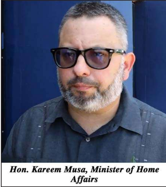
Hon. Kareem Musa, Minister of Home Affairs

Bermuda’s Minister Michael Weeks noted that there is no single person or entity that can be blamed for crime.