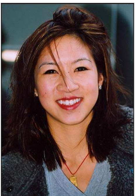
H.E. Michelle Kwan