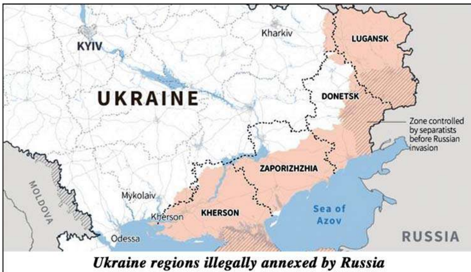
Ukraine regions illegally annexed by Russia