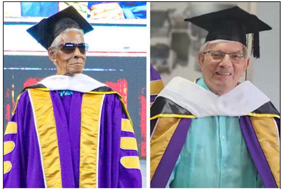
Dr. Gerald “Lord” Rhaburn and Rt. Hon. Dr. Said Musa

Musa is the nation’s first post-independence prime minister to serve two terms. He also made integral contributions to Belize’s push for self-governance and its acceptance into the United Nations. In addition to serving as the country’s prime minister, he also served as senator, Attorney General, Minister of Foreign Affairs, Minister of Education, and Minister of Economic Development. Prior to the graduation ceremony, Palacio visited the Rt. Hon Said Musa