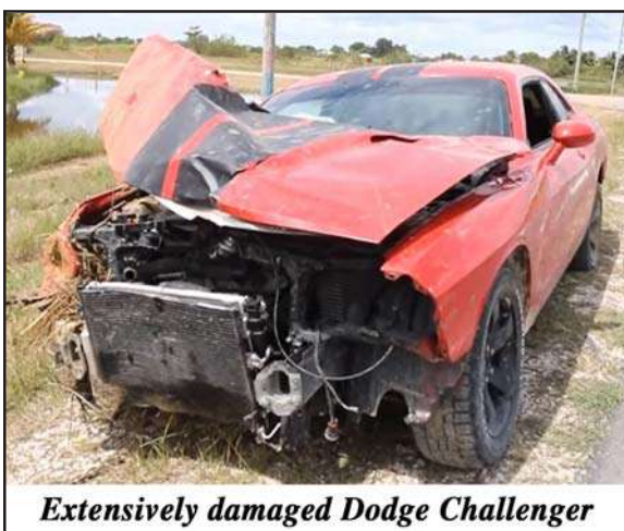
Extensively damaged Dodge Challenger

[resentment] would be something that he wouldn't want us to have, because really and truly, they were hanging out that same night, to my knowledge, and both of them see each other almost every day. It's really like a best friend thing they had," he said.