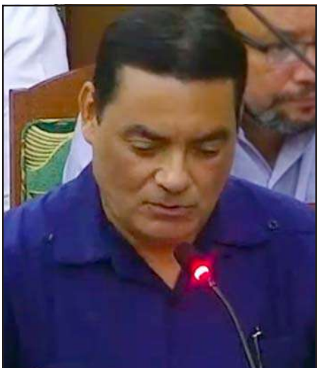
Francis Fonseca, Minister of Education

This transformation of the judiciary will be effected through the 12 th constitutional amendment. A bill for an act to repeal the Supreme Court of Judicature and Court of Appeal Act was read a third time as well.