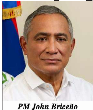
PM John Briceño