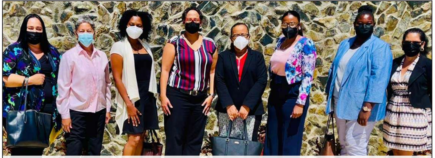
Belize’s women parliamentarians

While the National Women’s Commission, as well as other