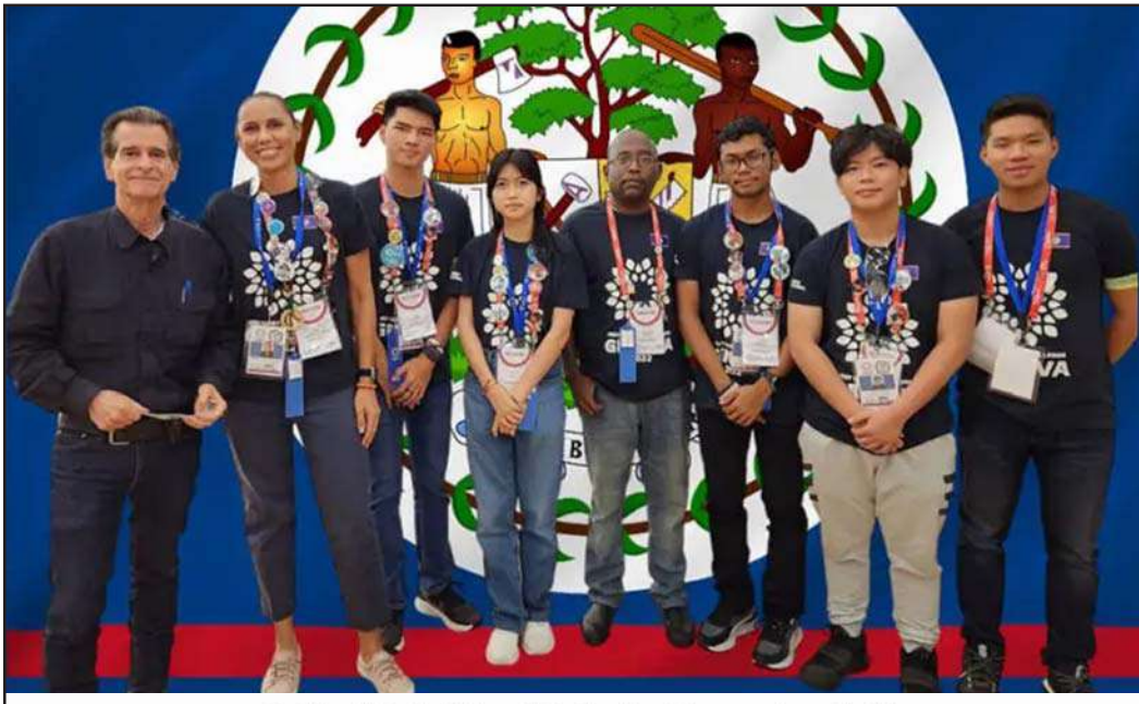
Belize High School Robotics Team wins Gold

face-to-face in Geneva, Switzerland. FIRST Global, a non-profit