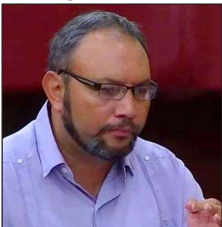
Hon. Henry Charles Usher, Minister of Constitutional Reform

BELMOPAN, Mon. Oct. 17, 2022 Today the bill for an act to establish the People's Constitutional