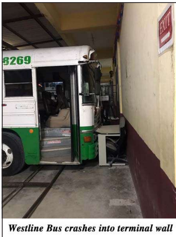
Westline Bus crashes into terminal wall

Montes was not supposed to have been on duty on Saturday, but according to the Minister of Transport,