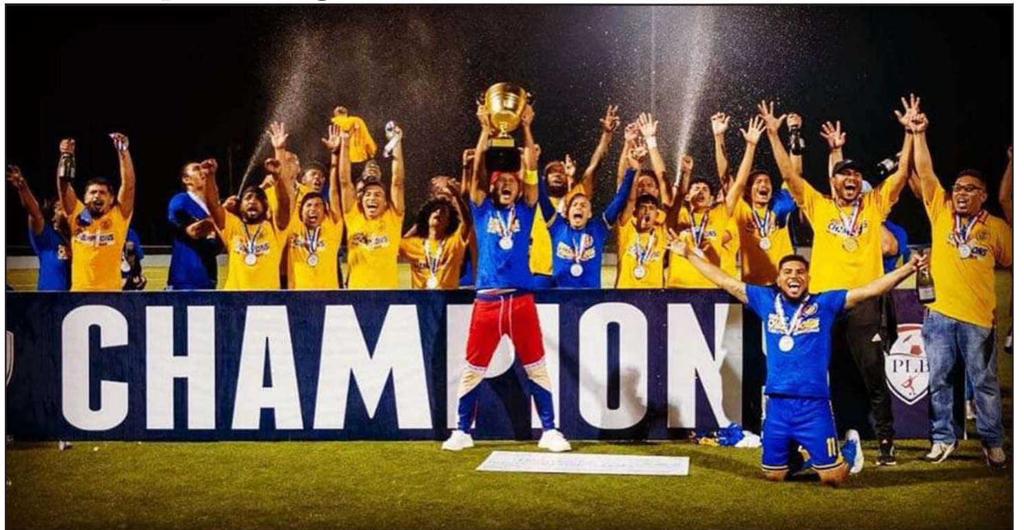
Altitude FC celebrate PLB Championship at Isidoro Beaton Stadium

After game 1 had ended in a 1-1 draw in San Ignacio on Sunday, November 27, game 2 was scheduled for Altitude’s home town of Independence last week Saturday night, December 3, but torrential rains caused a one-week postponement. And with