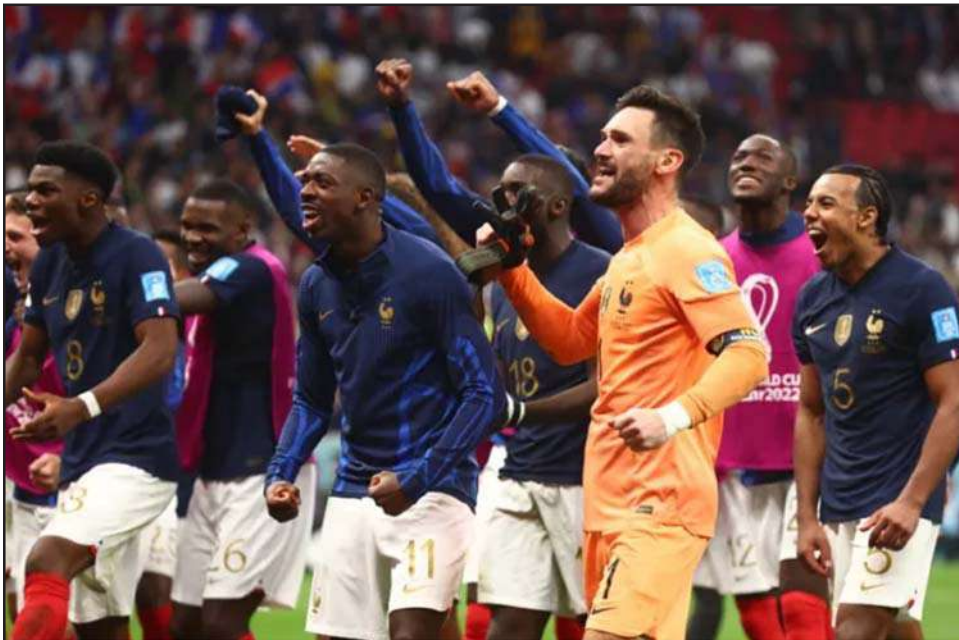
France celebrates after beating England at the 2022 World Cup.