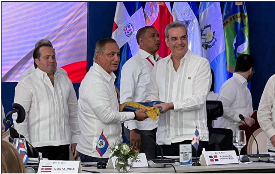
Luis Rodolfo Abinader Corona, president of the Dominican Republic, hands over the SICA presidency to Hon. John Briceño, Prime Minister of Belize