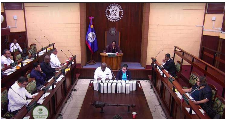
BELMOPAN, Mon. Dec. 12, 2022 Building on Independence Hill in Belmopan on December 12, to discuss the workings of government over the