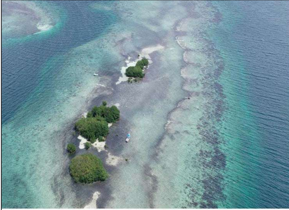
Angelfish Caye, proposed development area

The project will require dredging for reclamation of over one acre of land currently located in a marine area.