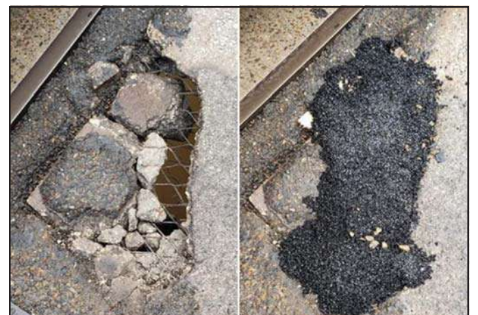
Condition of Haulover Bridge

Construction of a new bridge—a new “multiple-span reinforced concrete structure designed to AASHTO Standards”—is currently ongoing, according to the MIDH.