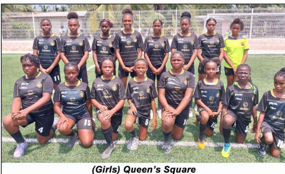
(Girls) Queen's Square