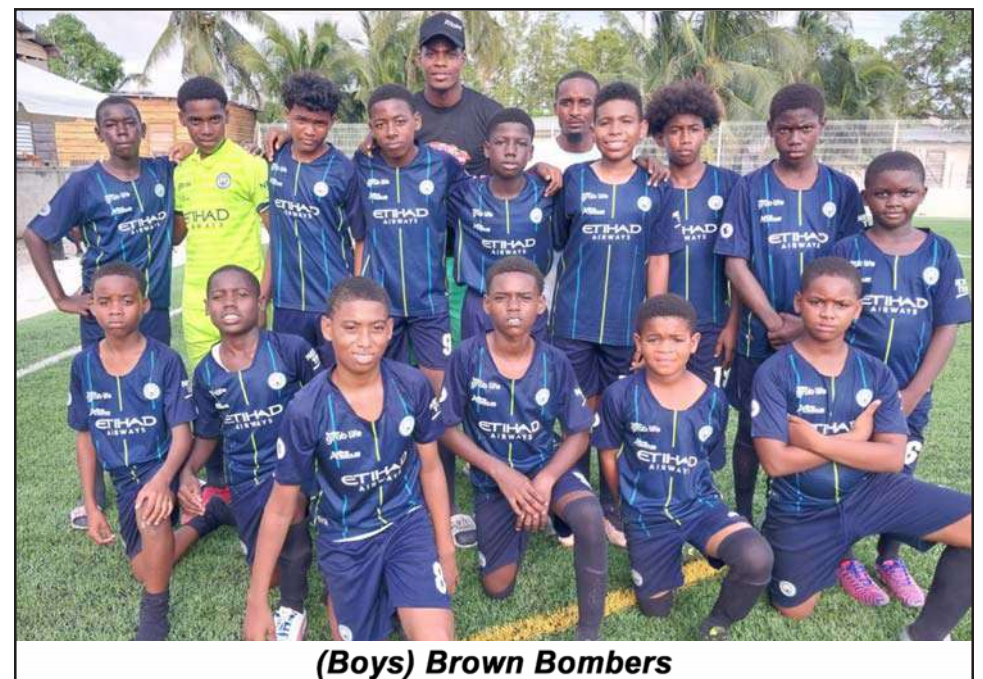
(Boys) Brown Bombers

American amnesia is certainly not color blind.