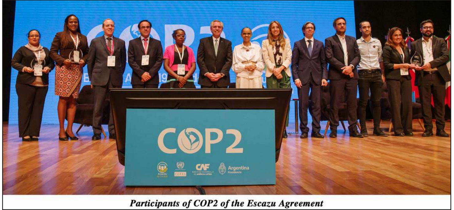
Participants of COP2 of the Escazu Agreement

the recently drafted Escazu Agreement: Antigua and Barbuda, Argentina, Belize, Bolivia, Chile, Ecuador, Grenada, Guyana, Mexico, Nicaragua, Panama, Saint Kitts and Nevis, Saint Lucia, Saint Vincent and the Grenadines, and Uruguay.