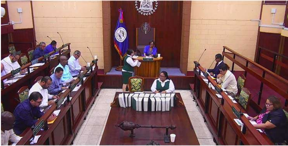
Sitting of the House of Representatives, April 21, 2023