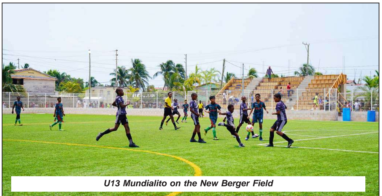
U13 Mundialito on the New Berger Field

1:10 p.m. – (B) Reality Youths vs Ladyville Rising Stars