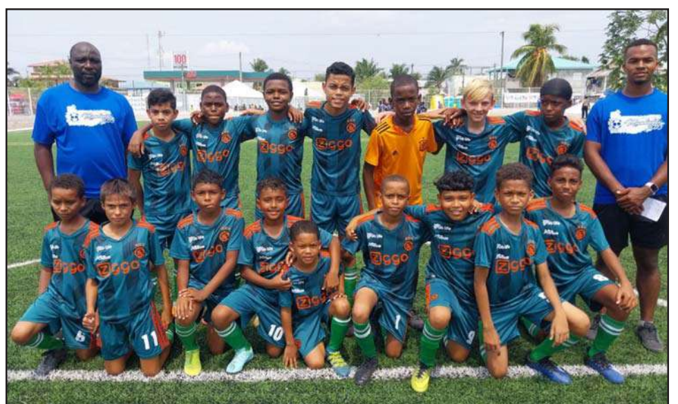
(Boys) Belize United