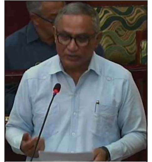
PM John Briceño

The Public Sector Emolument Reduction Amendment Bill 2023 was introduced and taken through all its stages at last Friday’s sitting. This piece of legislation authorizes the reinstatement of increments for public officers and