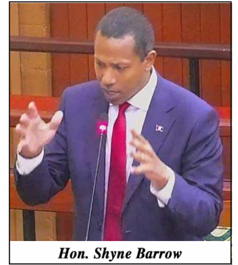
Hon. Shyne Barrow

“Two thousand Haitian nationals cannot disappear without some type of corruption taking place in the Ministry of Immigration,” Barrow said. Barrow questioned why the former Minister of State in the Ministry of Immigration, Hon. Ramon Cervantes was