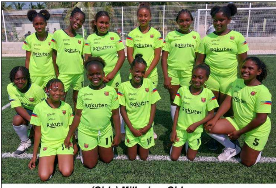
(Girls) Millenium Girls