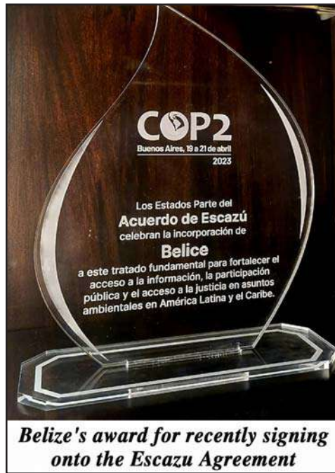
Belize's award for recently signing onto the Escazu Agreement