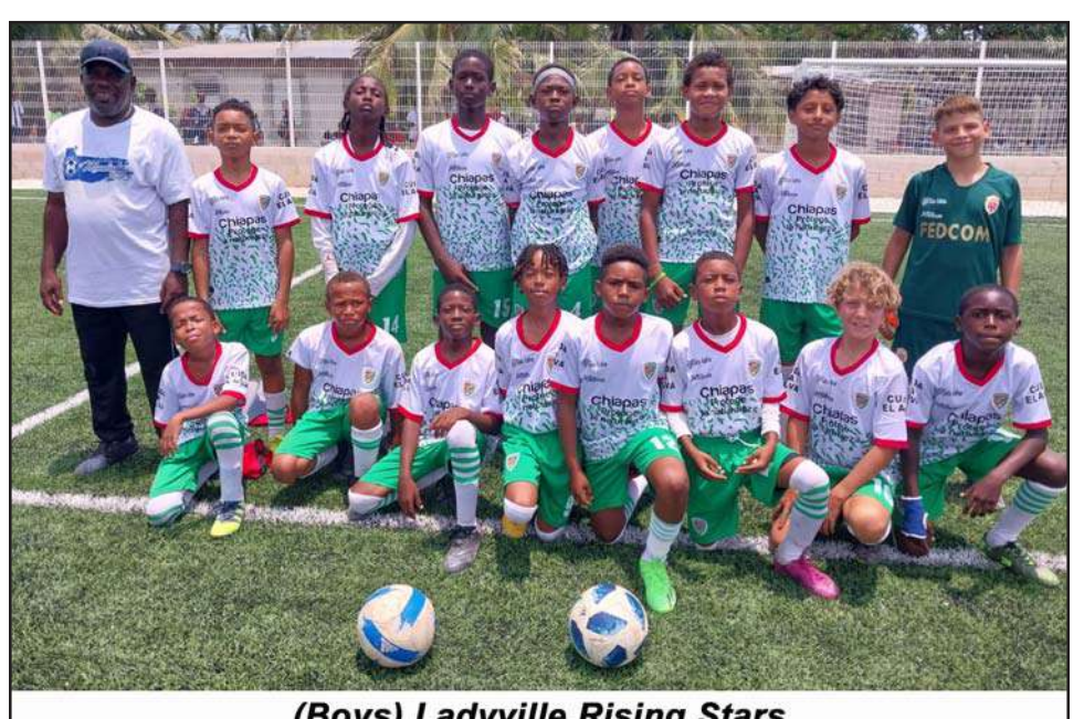
(Boys) Ladyville Rising Stars