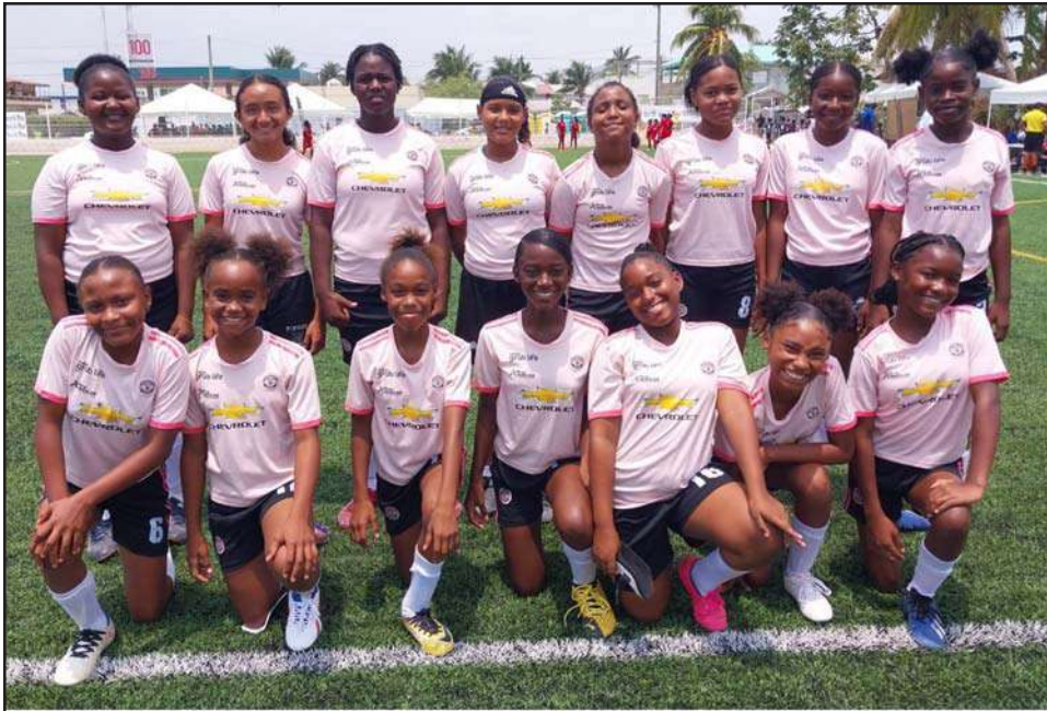
(Girls) Royal Fusion